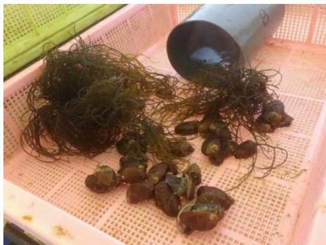
Figure 2. Abalone larvae were stocked in the container.