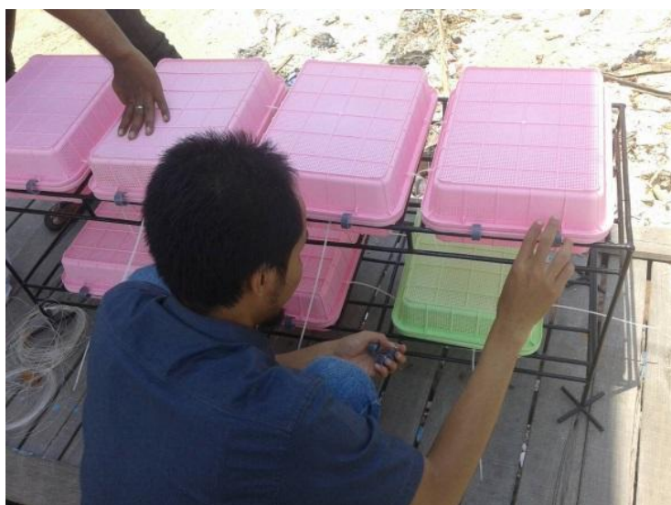
Figure 1. Abalone Rearing Containers.

A container with Abalone Juvenile larvae stocking density of 30 pcs/container (Figure 2).