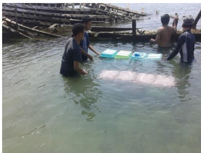
Figure 3. Positioning the containers with abalone larvae.