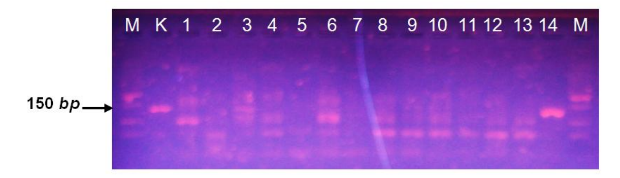
Fig. 3. PCR products detected NPV in silkworm larvae in several strains. M. 50 bp marker; K. Positive Control (purified NPV); 1. C301 larvae 2<sup>nd</sup> instar; 2-3. PS01 larvae 4<sup>th</sup> instar; 4-5. PS01 larvae 5<sup>th</sup> instar; 6. PS01 larvae 3<sup>rd</sup> instar; 7. PS01 larvae 4<sup>th</sup> instar; 8. S01 larvae 3<sup>rd</sup> instar; 9-10. S02 larvae 3<sup>rd</sup> instar; 11. S02 larvae 2<sup>nd</sup> instar; 12. S03 larvae 3<sup>rd</sup> instar; 13. S01 larvae 5<sup>th</sup> instar; 14. PS01 larvae 5<sup>th</sup> instar