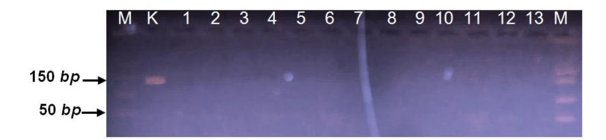
Fig. 1. PCR products detected NPV in silkworm eggs in several strains. M. 50 bp marker; K. Positive Control; 1. strain C301 (producer); 2. Strain PS01 (producer); 3-5. Strains S01, S02, S03 (producer); 6. Strain PS01 (producer); 7. Strain S01 (producer); 8. Imported Eggs; 9-11. Strains S1, S2, S3; 12-13 (producer). Broodstock and F1 Hybrids (producers)