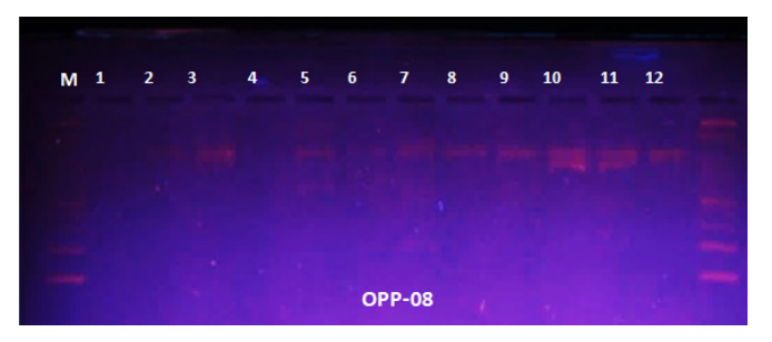
Figure 1: Electropherogram of DNA amplification products using OPP-08. Notes: 1-12 = Jabon putih DNA samples

The primer screening of 21 RAPD primers selected three primers that were able to generate polymorphic bands. Those primers were OPP0-08, OPY-09, and OPD-20. The selected primers are presented in Figure 1.