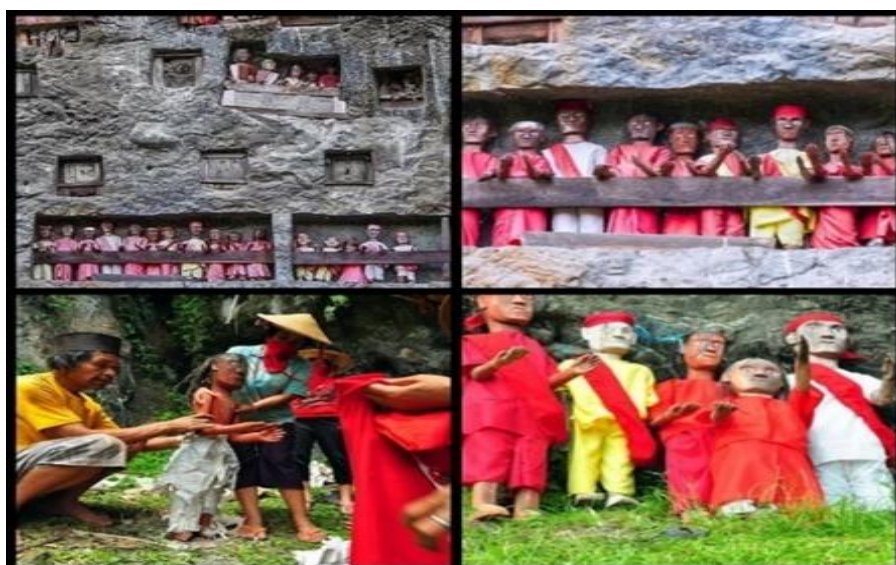
Picture 4.2 Massonda bayu tau-tau 'change the clothes of the statue' that has been weathered and damaged.

Ma'kassa'i is carried out for the next three days according to the agreement of the family rumps, including replacing rotten or damaged crates and if there are rnyat that will be moved to a new liang or patane made by the family. On the last night of ma'kassa'i on the fourth day, before the next day the corpses were put in, they also stayed in the huts so that they could accompany the ancestors, this was also a sign of their love and respect for the ancestors.