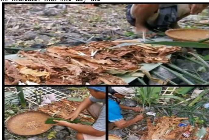
Picture 4.7 Pangngan 'sirih' used in ritual