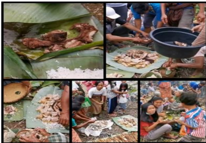
Picture 4.8 Family and community groups take ritual offerings and distribute the to relatives who come as a sign of thanksgiving

The purpose of all actions in the ma'nene' ritual is that these animals can be used for offerings in order to bring sustenance, but humans must not be greedy for excessive slaughter, and follow the rules set out in the Aluk , and are interpreted as an expression of gratitude for farm animals, plants and human life.