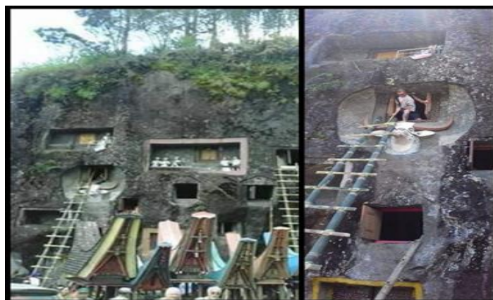
Picture 4.1 The implementation of the Ma'nene' ritual begins with the Ma'bungka' stage of 'opening the door' of the liang 'grave of stones'.