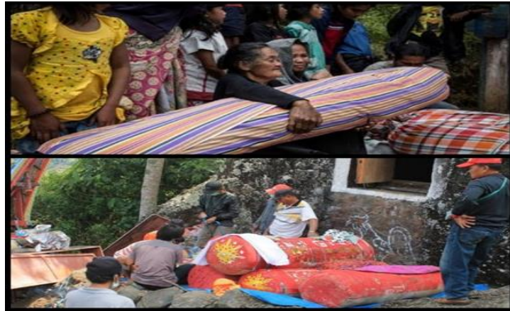
Picture 4.5 The process of entering the bodies one by one, starting with the oldest corpse.

The next stage is mantutu 'closing the door'. In this step, the corpses are put back into the burrow, then the messenger closes the door to the burrow as a sign of the end of the ma'pakande nene ritual.