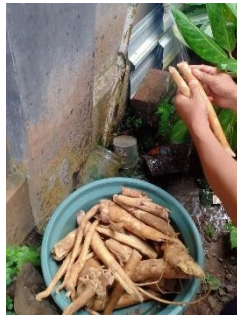
Pencucian akar kelor