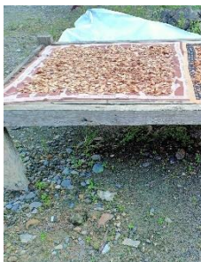
Pengeringan sinar matahari