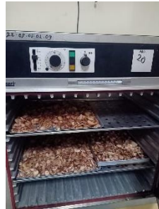
Pengeringan dengan oven