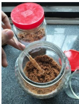
Pengadukan sampel dan pelarut