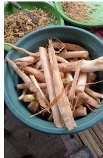
Pengupasan kulit akar kelor