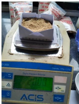
Penimbangan serbuk akar kelor