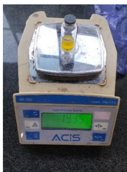
Penimbangan dan pengemasan sampel pada botol vial