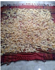
Pengeringan pada suhu ruang