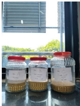
Wadah maserasi berisi sampel