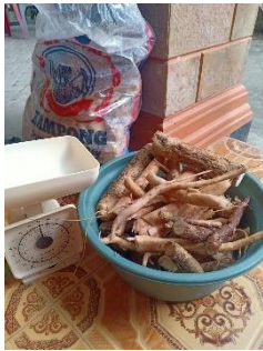
Persiapan akar kelor