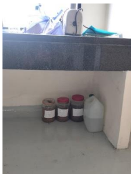
Proses maserasi selama 3 hari