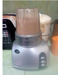
Penghancuran akar kelor