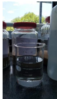
Pengukuran volume pelarut