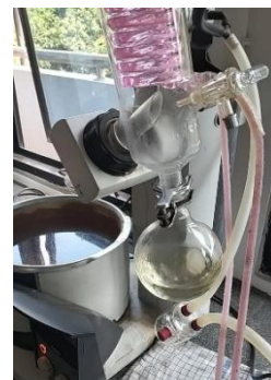
Penguapan dengan Rotary Vacum Evaporator