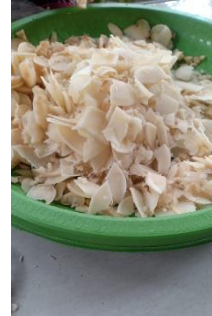
Pengirisan akar kelor