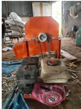
Lampiran 8. Hasil jadi