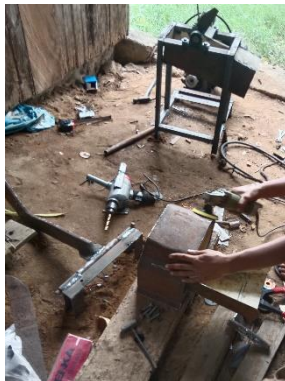
Lampiran 6. Pengamplasan