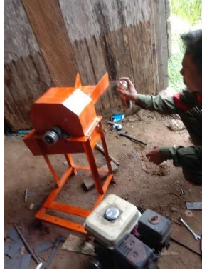
Lampiran 7. Pengecatan