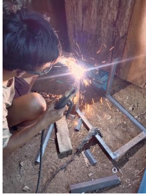
Lampiran 4. Pengelasan