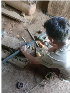
Lampiran 3. Pemotongan