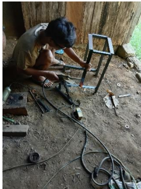
Lampiran 5. Bentuk rangka