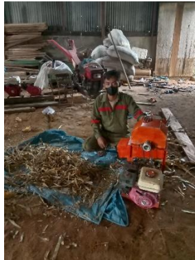
Lampiran 9. Hasil jadi