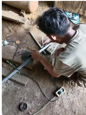
Lampiran 2. Pengukuran