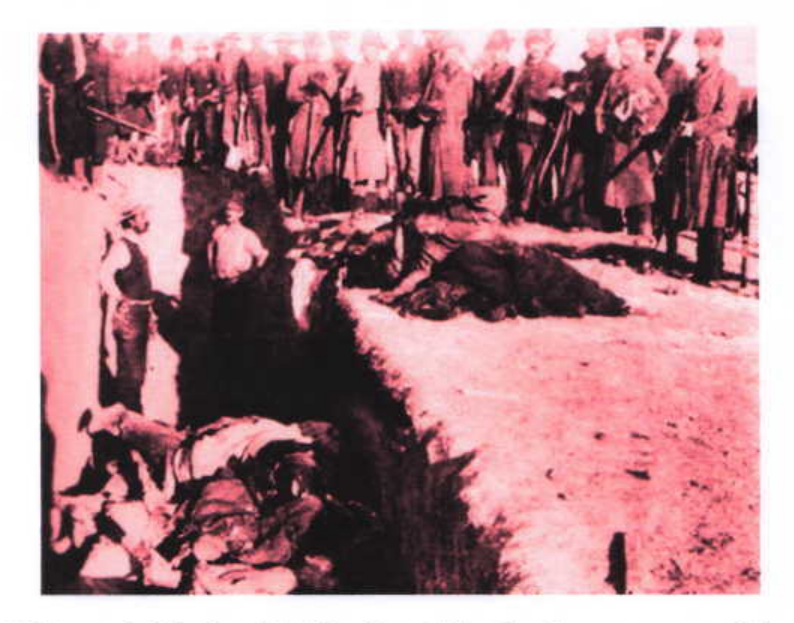
Picture 2. The burial of Indians killed in the massacre of the Wounded Knee in the late 1880s.