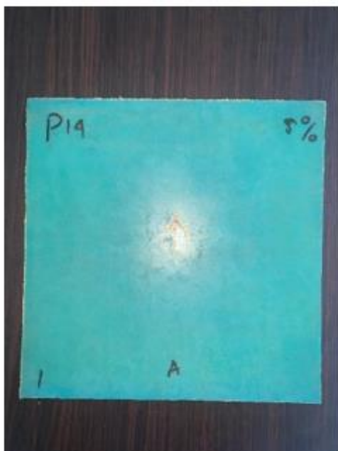
Lampiran 7 Panel