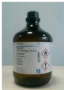
Gambar 12. Aceton