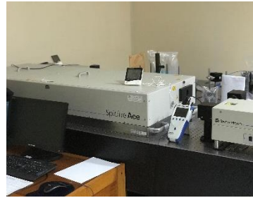
Gambar 8. Laser Femtosecond Ti:Sapphire