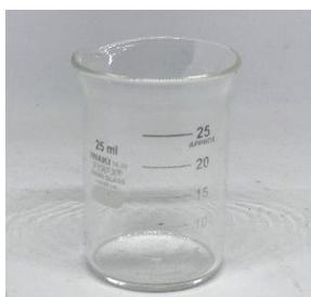
Gambar 1. Gelas beaker