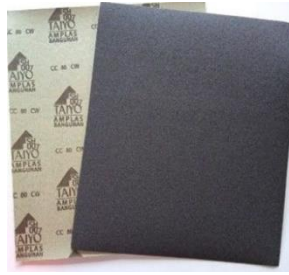
Gambar 7. Sand Paper