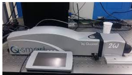
Gambar 9. Laser Nanosecond Nd:YAG