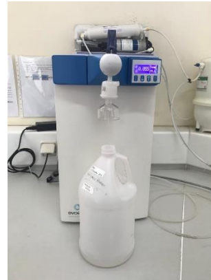
Gambar 11. Pure Water