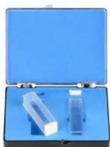
Gambar 3. Kuvet