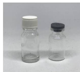
Gambar 4. Botol Sampel