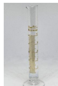
Gambar 2. Gelas Ukur 100 mL