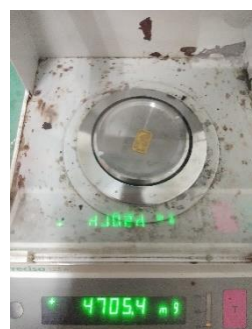
Gambar 6. Neraca Analitis