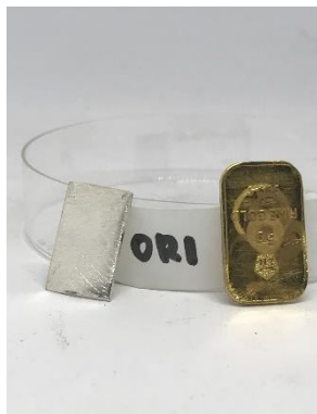
Gambar 10. Plat Perak & Emas Batang