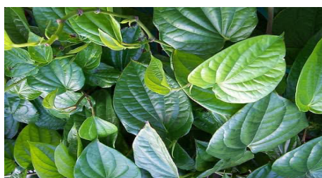
Figure 3. Betel Leaf Plant (Piper Betle L.)

Piper Betle L. Or better known as betel leaf is one of the climbing herbaceous plants belonging to the Piperraceae family. Betel leaf plants thrive throughout tropical Asia to East Africa, spreading in almost all regions in Indonesia, Malaysia, Thailand, Sri Lanka, India, to Madagascar. 6 Betel leaf extract is used as a plant to treat various diseases. Treatment with betel leaf extract has traditionally been proven to be able to cure diseases and increase body fitness. 4