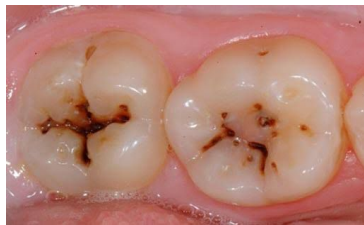
Figure 2.2 An example of a dental caries visual.

Dental caries is an infection that attacks the oral cavity and is caused by bacterial destruction of the hard tissues of the teeth (enamel, dentin and cementum) caused by demineralization of enamel and dentin which is closely related to the consumption of cariogenic foods, teeth and saliva, bacteria in the oral cavity, and foods that are easily fermented. 14 Damage to the hard tissues of the teeth, if not treated immediately, will spread. If left untreated, cavities will cause toothache and pain, gum infection, tooth loss and even death. 15