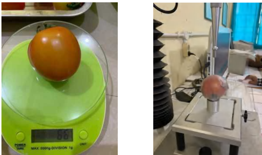
Gambar 7. Pengamatan Uji Tekstur, Uji Susut Bobot dan Uji vit C pada buah Tomat