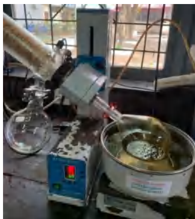
Israt ekstrak jahe kemudian dikentalkan menggunakan vacuum rotary evaporator