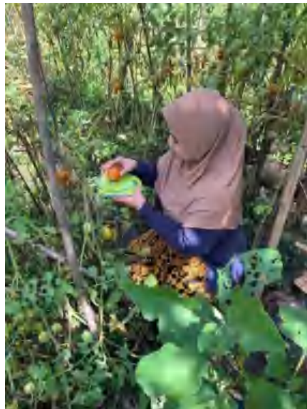
Gambar 1. Pengambilan sampel tomat Lokasi : Kel. Kassa, Kec. Batulappa, Kab Pinrang