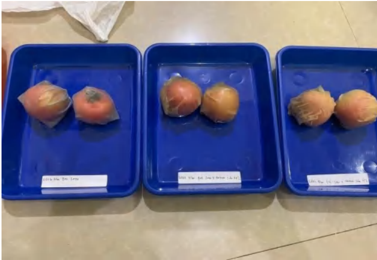
Gambar 9. Hasil Edible Film Pati singkong dan Pati Sagu