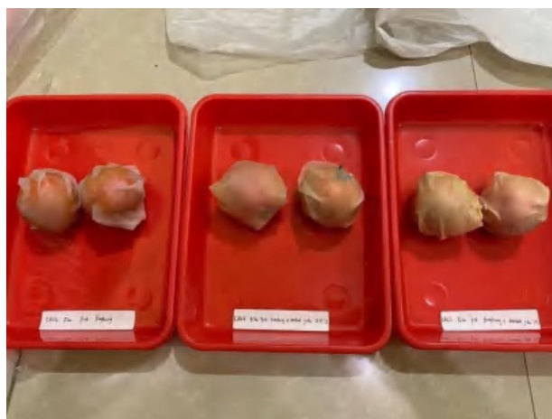
Gambar 8. Hasil Pembungkusan Tomat Edible film Singkong dan pati sagu