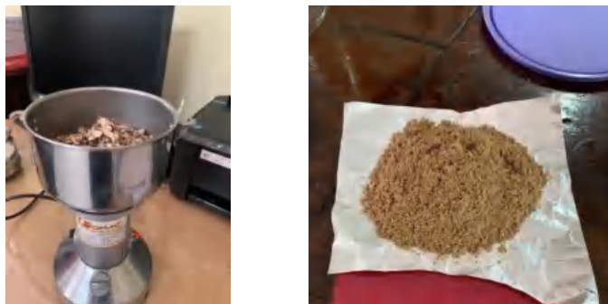
Gambar 3. Proses penghalusan dan pengayakan jahe merah dengan ayakan 40 mesh