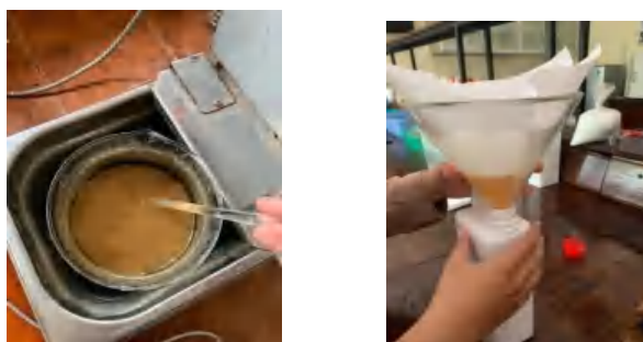
Gambar 4. Serbuk jahe merah dilarutkan dalam etanol 96% dan dipanaskan selama 120 menit pada suhu 40°C