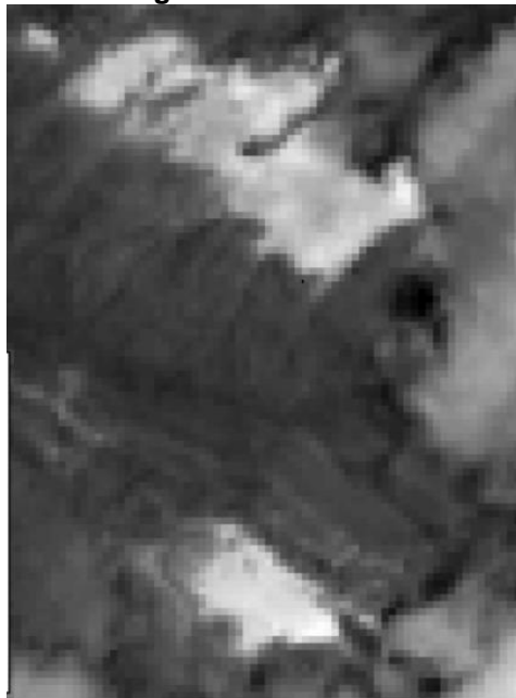
Gambar 8. Salju sebelum digitasi