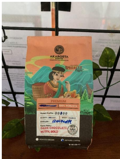
Kopi bubuk yang dikemas dalam ukuran 150 gr