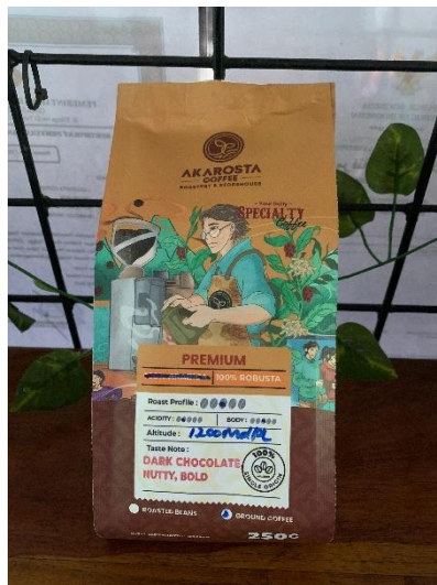
Kopi bubuk yang dikemas dalam ukuran 250gr