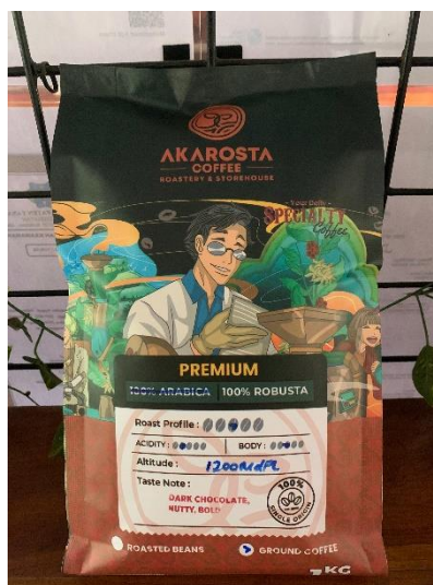
Kopi bubuk yang dikemas dalam ukuran 1kg