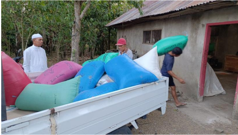
Gabah hasil panen siap di Pabrik