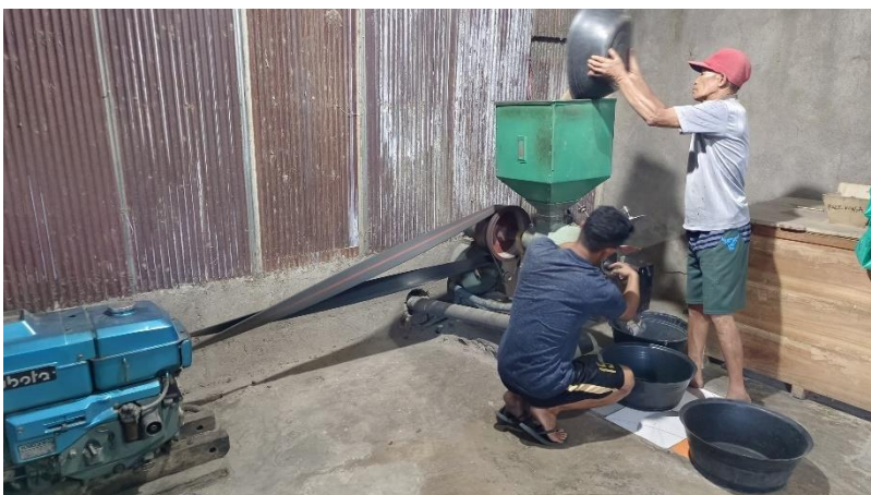
Bangunan Pabrik Beras