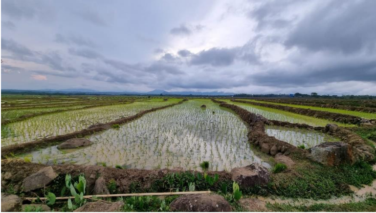
Lahan Sawah Ethical Red Rice by Ethical Meal