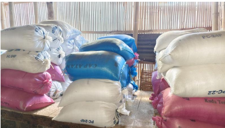
Gudang Penyimpanan Gabah Hasil Panen