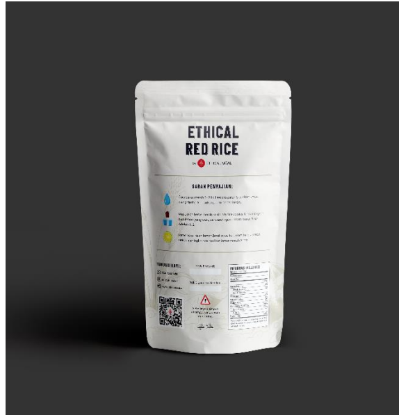
Kemasan 800gr (perubahan ada pada bahasa yang digunakan, kini menggunakan bahasa Indonesia)