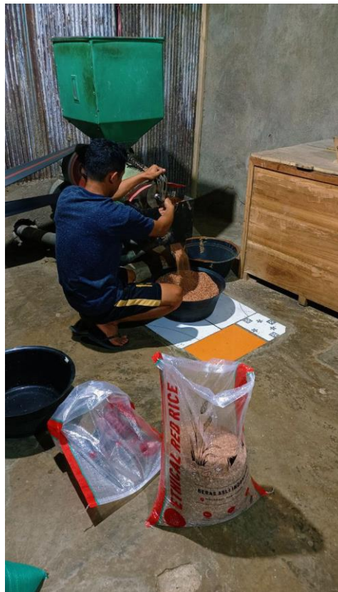
Proses Penggilingan Gabah dan Pengemasan Beras