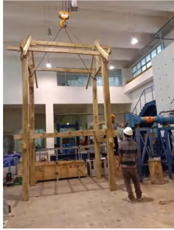
6. Hasil perakitan spesimen struktur rumah panggung Bugis-Makassar