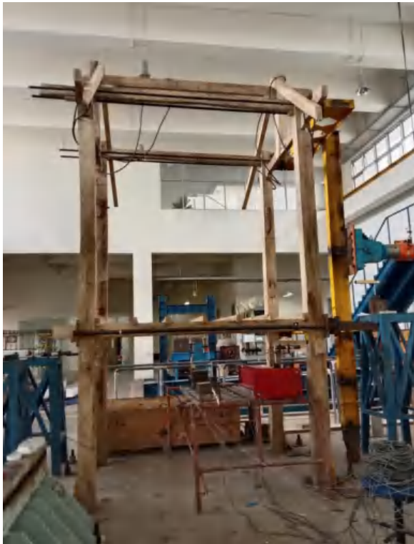
11. Pengujian spesimen pada arah pembebanan tekan (+), terlihat miring ke arah belakang