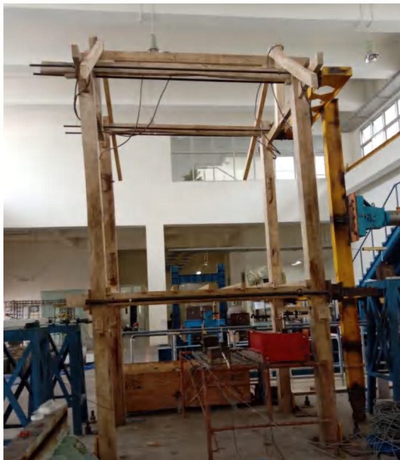
16. Hasil pengujian spesimen pada saat pembebanan maksimum