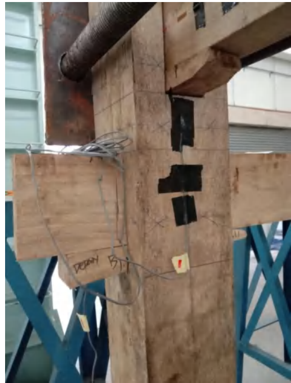
9. Pemasangan strain gauge pada area dekat sambungan balok-kolom