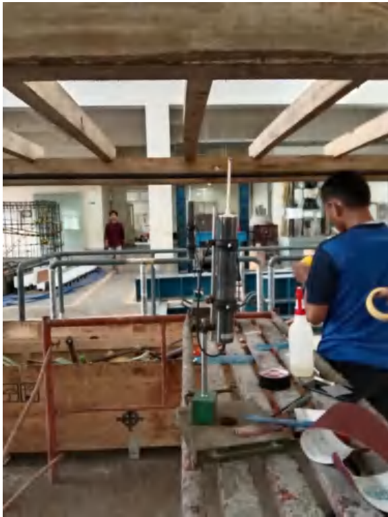
8. Persiapan pemasangan LVDT