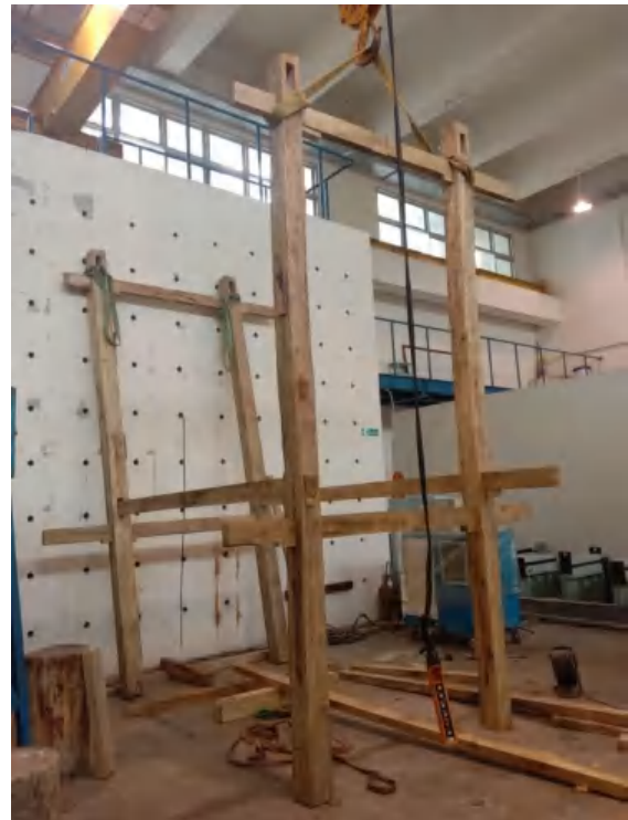
4. Proses perakitan dan menghubungkan kolom-balok depan dan belakang dengan balok melintang