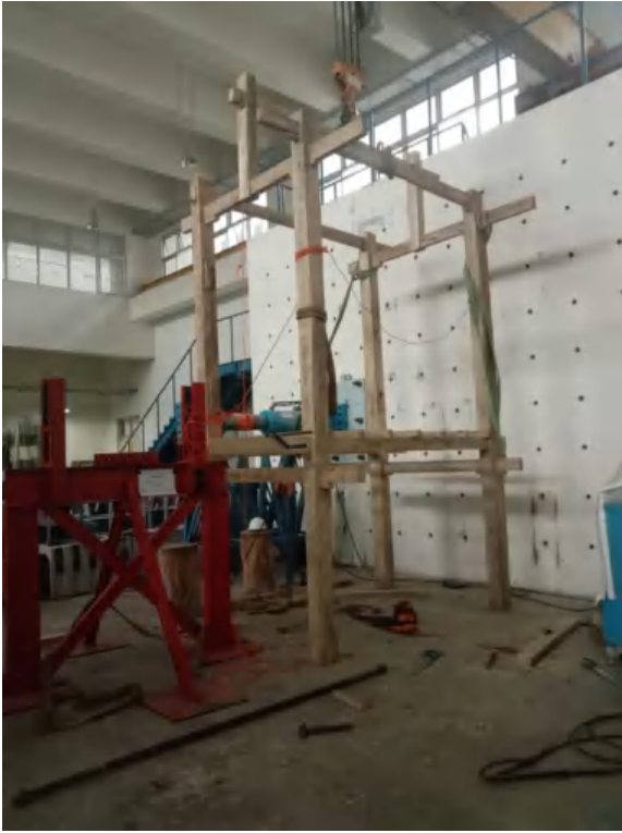
5. Perakitan struktur balok lantai dan struktur atap