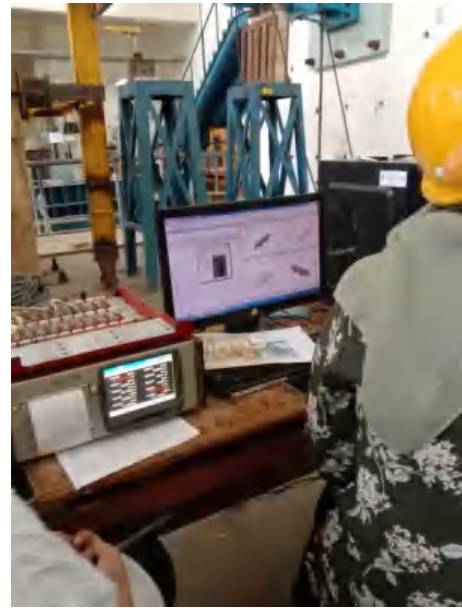
15. Kontrol kurva hysreritis di monitor data logger pada saat akhir pembebanan