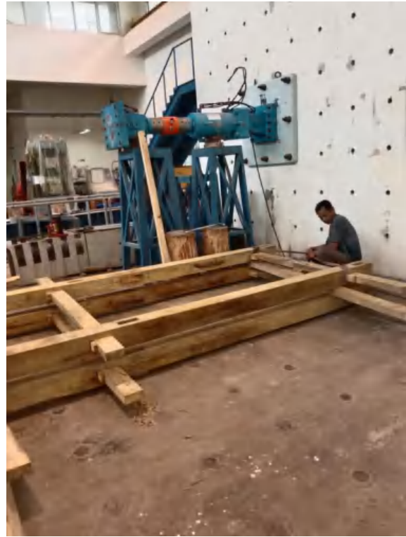
2. Perakitan kolom-balok untuk posisi belakang