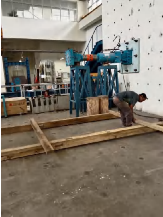
1. Perakitan kolom-balok untuk posisi depan