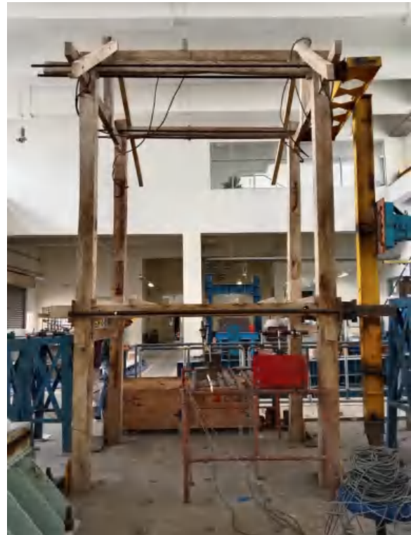
12. Spesimen kembali ke posisi semula setelah pelepasan pemberian beban, dan persiapan untuk pembebanan tarik (-)