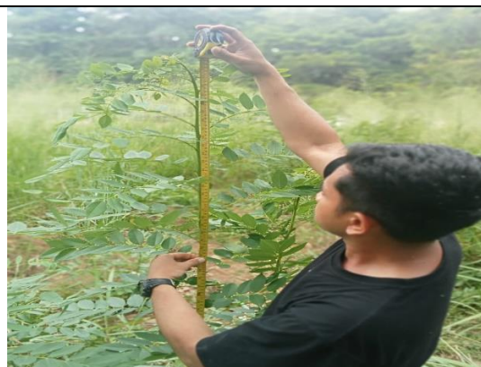
Pengukuran Tinggi Gamal 90 Hari