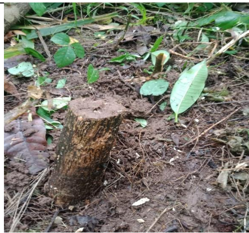
Pengukuran Tinggi Gamal 15 Hari