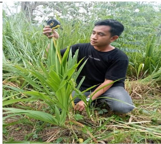
Pengukuran Tinggi Rumput Gajah Mini 30 Hari