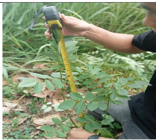
Pengukuran Tinggi Gamal 45 Hari