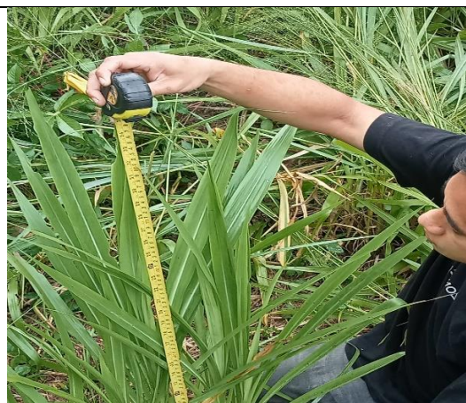
Pengukuran Tinggi Rumput Gajah Mini 45 Hari