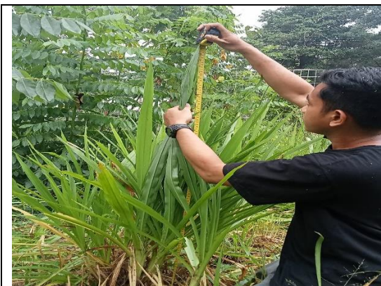
Pengukuran Tinggi Rumput Gajah Mini 90 Hari