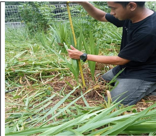
Pengukuran Tinggi Rumput Gajah Mini 15 Hari