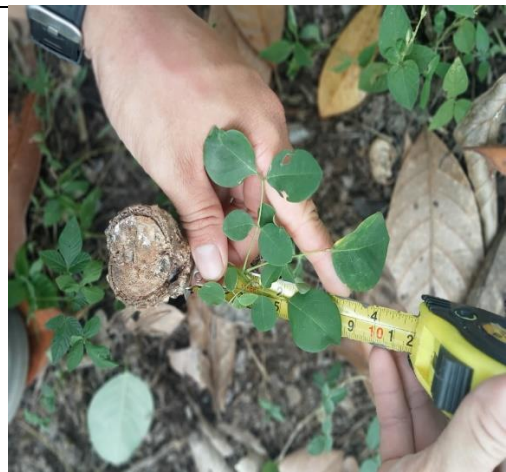
Pengukuran Tinggi Gamal 30 Hari