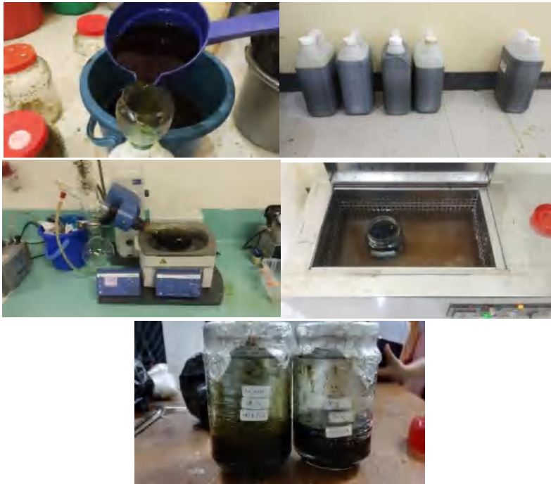
Lampiran 9. Proses pembuatan fermentasi kayu kakao