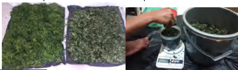
Lampiran 8. Proses pembuatan ekstrak daun kopi dan daun wortel