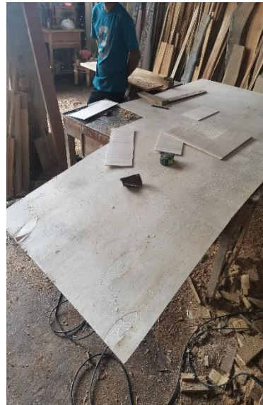
Gambar Lampiran 1. Pembuatan Arena Penelitian Preferensi dan Kotak Penelitian Pertumbuhan