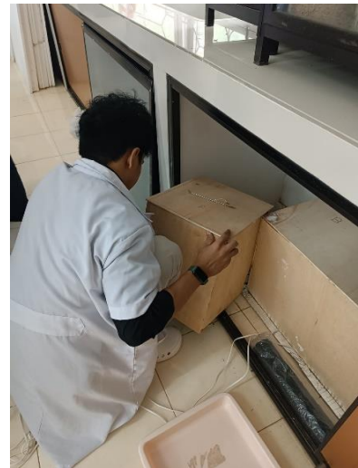
Gambar Lampiran 2. Persiapan Penelitian Pertumbuhan Rhizopertha dominica pada berbagai Warna Lampu