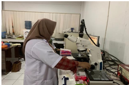
Pemeriksaan Kualitas Semen