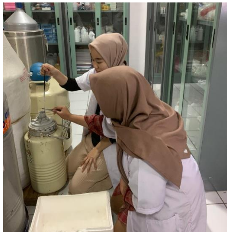
Penyimpanan Semen Kedalam Kontainer Nitrogen