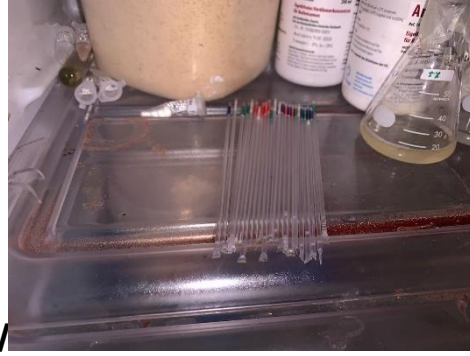
Equilibrasi Suhu 5°C