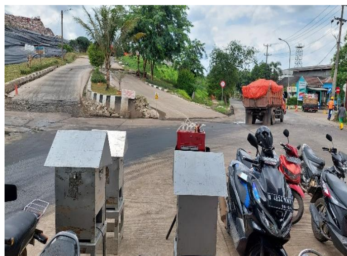
Pengukuran Kualitas Udara