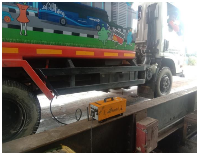
Pengukuran Emisi Truk