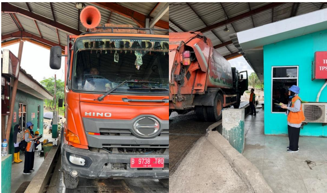
Survei Lalu Lintas