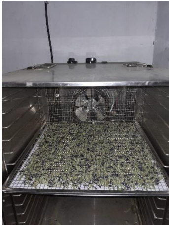
Ket. Pengovenan Bunga Telang