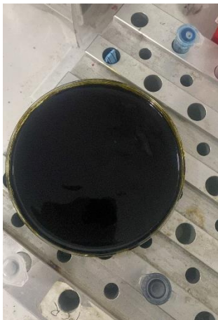
Ket. Ekstrak Bunga Telang