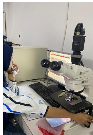
Ket. Pengamatan Spermatozoa