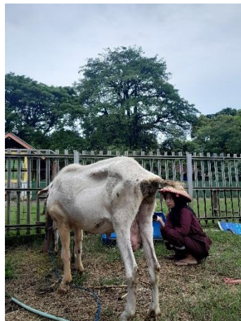
Ket. Penampungan Semen