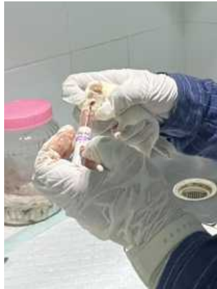
Gambar 5. Pengambilan sampel darah