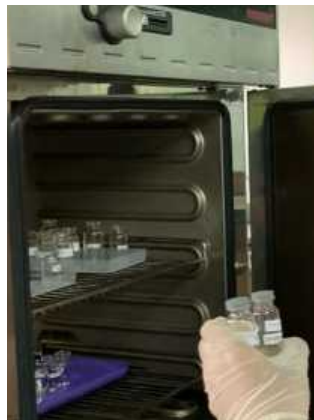
Gambar 6. Ekstraksi rivastigmin dari sampel