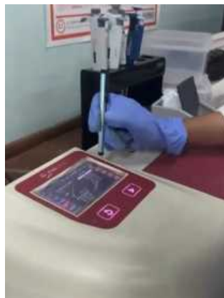
pengukuran menggunakan spektrofotometer UV-Vis