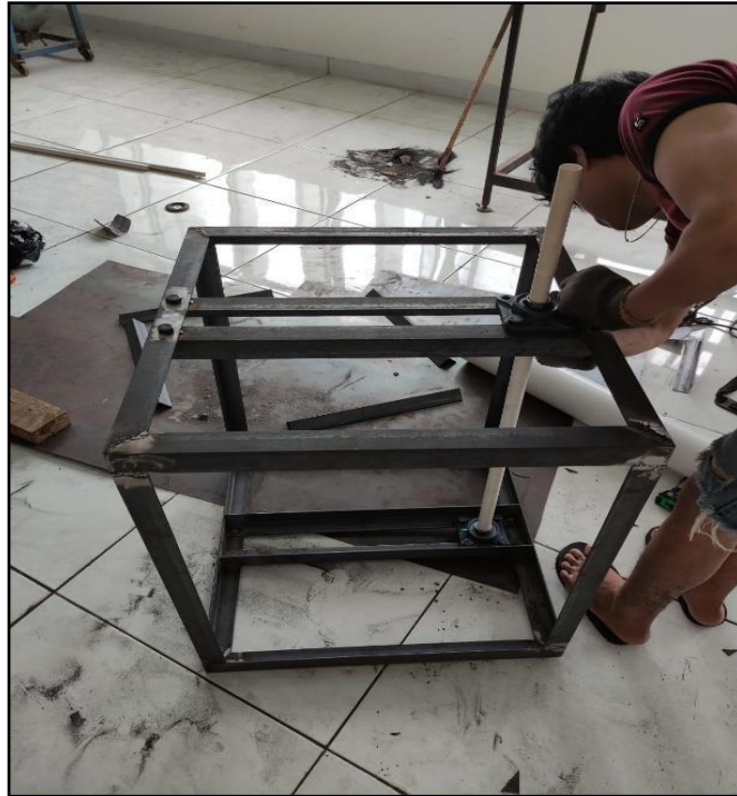
Lampiran 5. Dokumentasi Pengambilan Data di Lokasi Penelitian