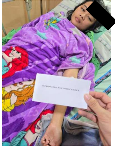
Gambar 1. Sampel dan penentuan jenis blok yang akan diberikan.