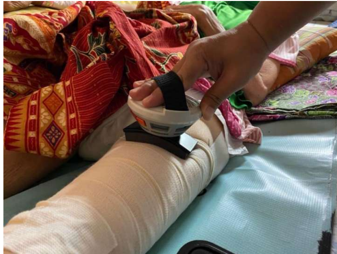
Gambar 2. Pengukuran kekuatan otot pasien diruang perawatan, sebelum tindakan operasi dengan menggunakan alat hendel dynamimeter microfet 2 .