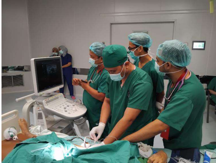
Gambar 5. Tindakan blok saraf perifer pada pasien setelah tindakan operasi.