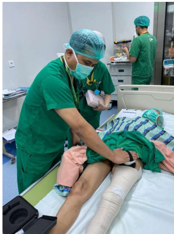
Gambar 4. Pengukuran kekuatan otot pasien diruang operasi, sebelum tindakan operasi dengan menggunakan alat hendel dynamimeter microfet 2 .