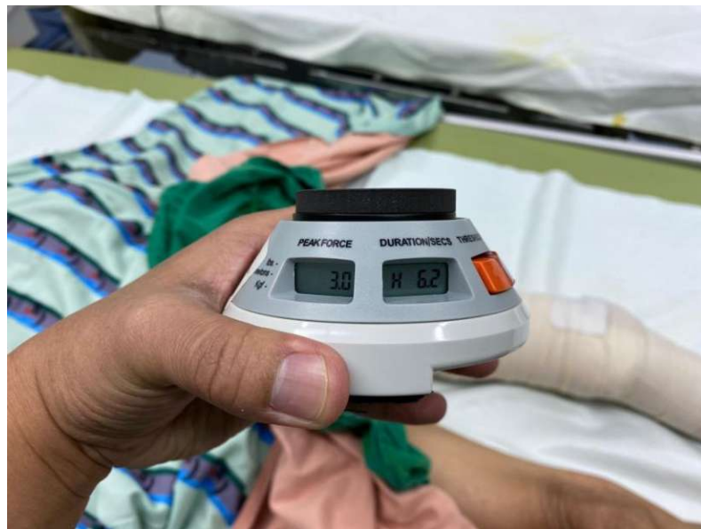
Gambar 8. Tampilan hasil pengukuran otot dengan menggunakan hendel dynamometer microfet 2 .