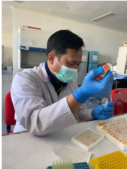
Gambar 10. Proses pengisian reagen IL-6 dan serum sampel di Laboratorium RSPTN UNHAS Lantai 6.