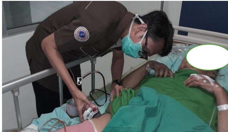
Gambar 7. Pengukuran kembali kekuatan otot pada pasien setelah tindakan blok saraf perifer diruangan pasca operasi THA.