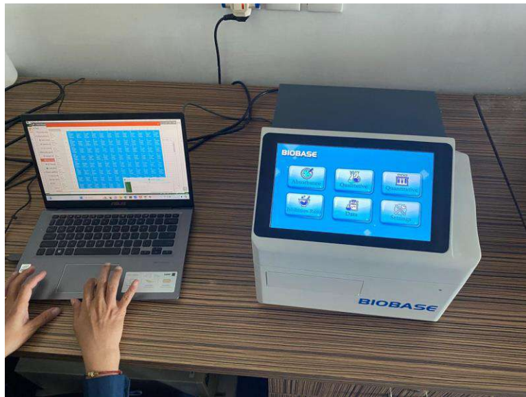
Gambar 11. Alat Elisa perhitungan kadar IL-6