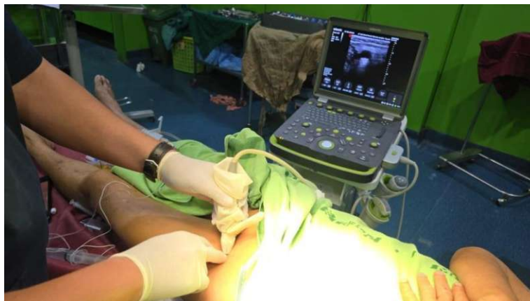
Gambar 6. Tindakan blok saraf perifer pada pasien setelah tindakan operasi.