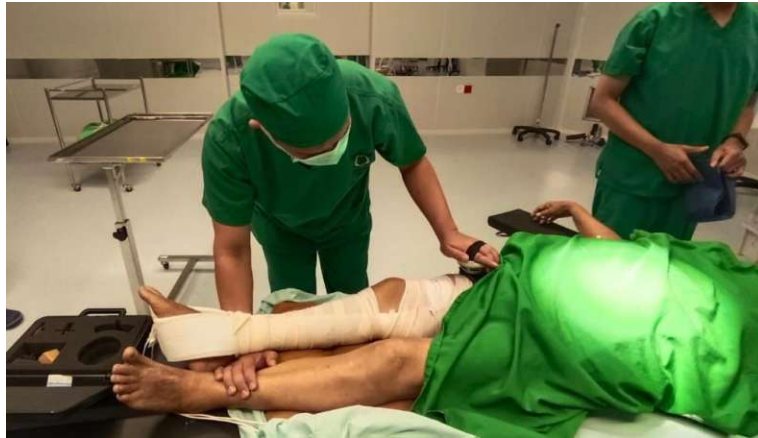
Gambar 3. Pengukuran kekuatan otot pasien diruang operasi, sebelum tindakan operasi dengan menggunakan alat hendel dynamimeter microfet 2 .