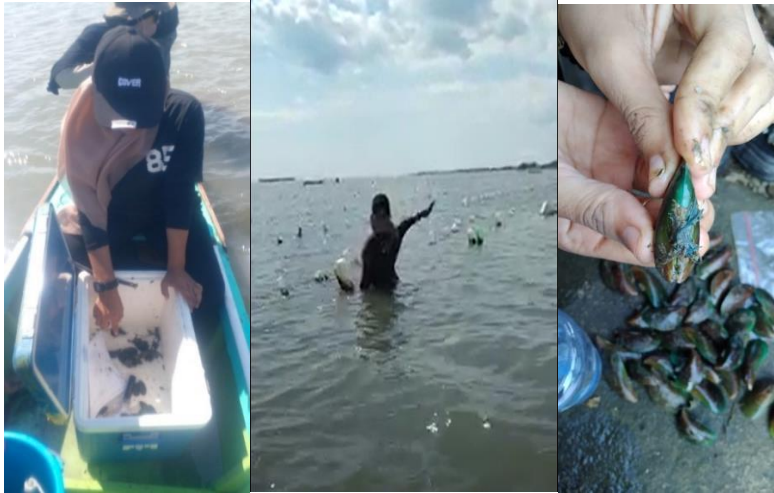
Lampiran 2. Proses Pengukuran morfometrik dan penimbangan bobot kerang hijau