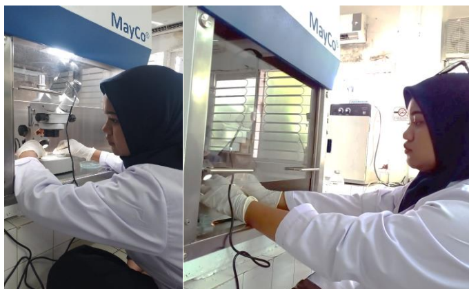
Lampiran 6. Proses uji polimer menggunakan FTIR terhadap insang kerang hijau