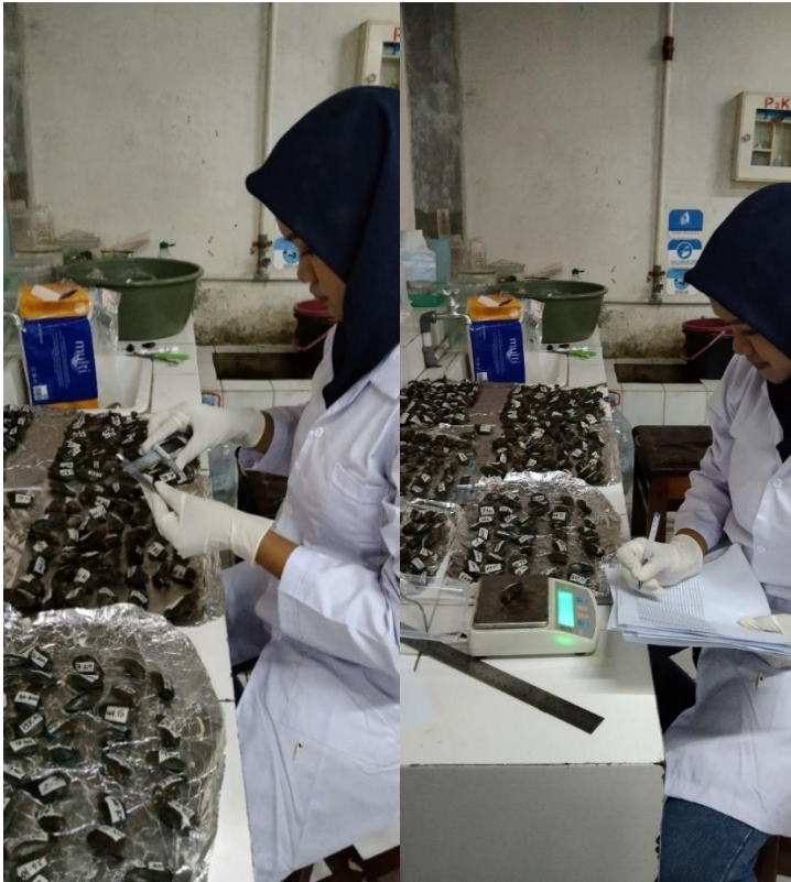
Lampiran 3. Proses pengambilan sampel hemolimfa kerang hijau