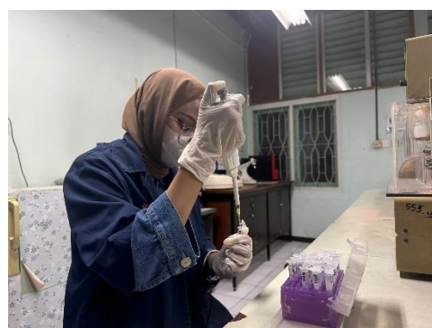
Gambar 16. Pengukuran hasil uji permeasi secara ex vivo