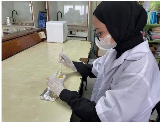
Gambar 13. Formulasi SEMNs-RT