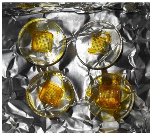
Gambar 17. Blank SEMNs-RT yang telah dicetak