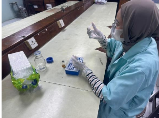
Gambar 12. Pembuatan larutan stok dan pengukuran kurva baku