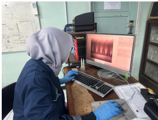
Gambar 14. Karakterisasi fisika SEMNs-RT