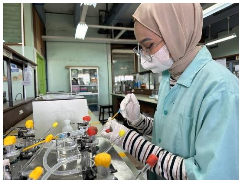
Gambar 15. Uji permeasi secara ex vivo