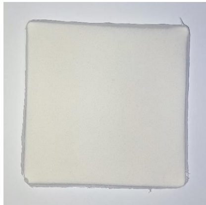
Sampel Selulosa/Bismuth 3% (A 3 )