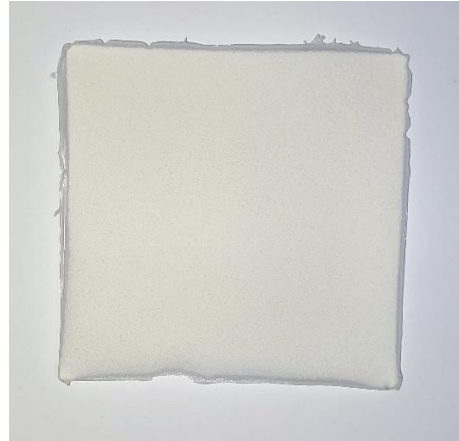
Sampel Selulosa/Bismuth 8% (A 2 )