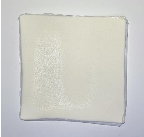
Sampel Selulosa/Bismuth 11% (A 1 )