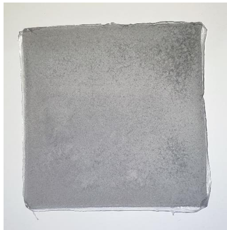
Sampel Selulosa/Tungsten 3% (B 3 )