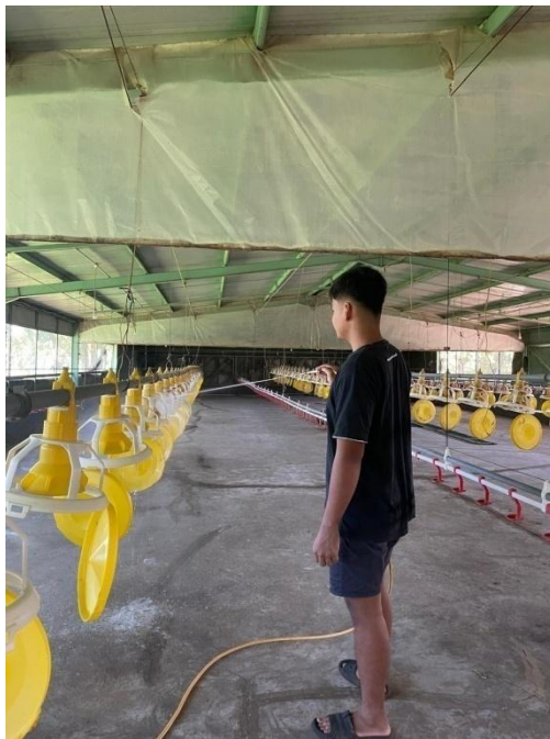
Ket. Pembersihan Kandang