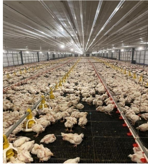
Ket. Kandang Slat Plastik