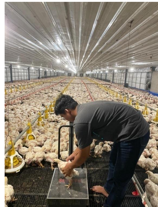
Ket. Penimbangan Bobot Badan