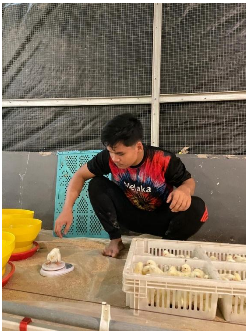
Ket. Penimbangan DOC