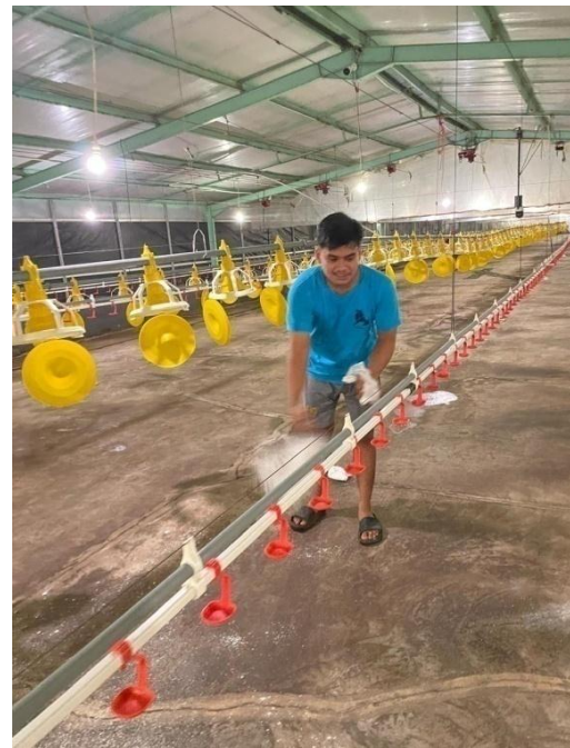
Ket. Penaburan Kapur