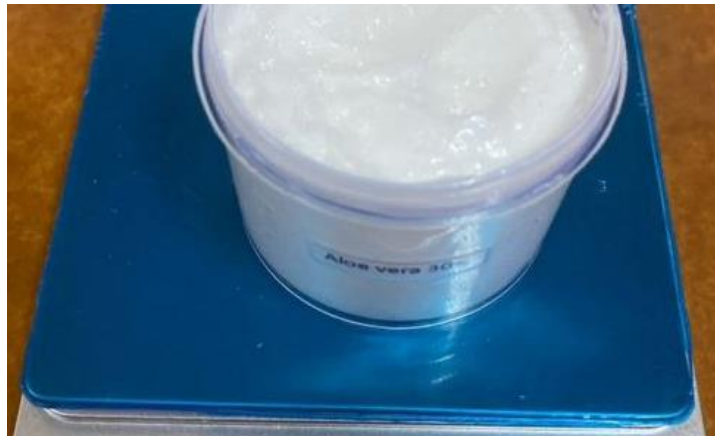
Penimbangan Aloe vera cream 30%