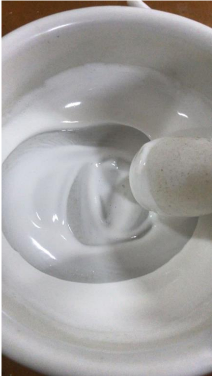
Massa urea cream yang sudah homogen