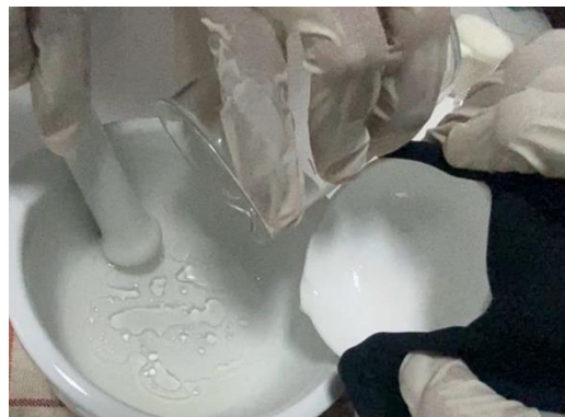
Pencampuran setelah peleburan