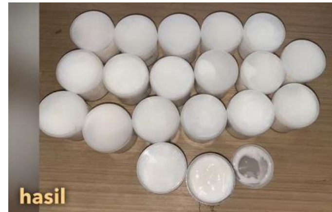
Sediaan aloe vera cream 30%