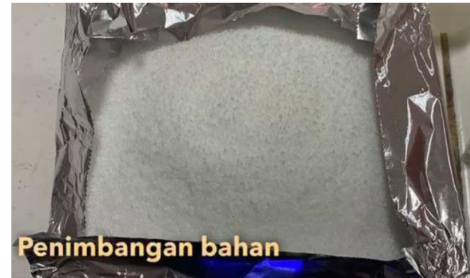
Alat dan Bahan