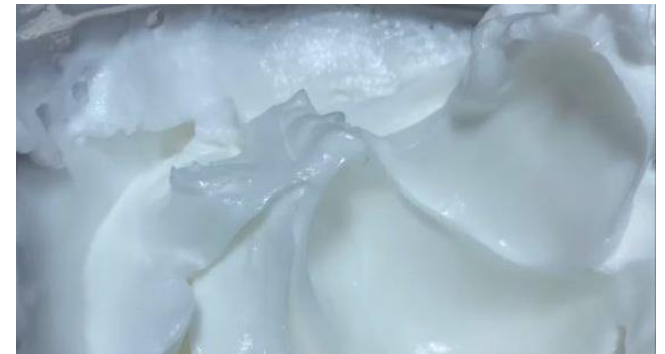
Massa Aloe vera 30%