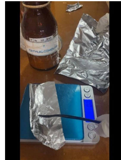
Penimbangan bahan fase minyak