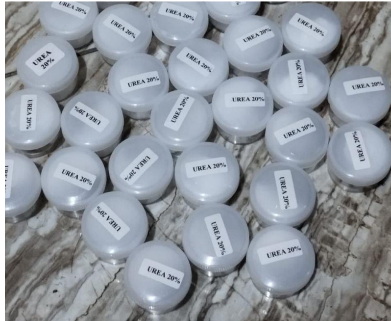
Urea cream 20%