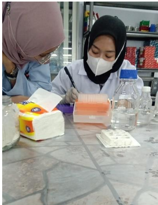
Gambar 1. Penulisan nomor sampel pada microtube