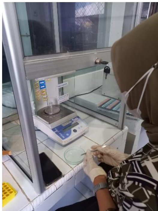
Gambar 2. Proses pengambilan otot pada sampel ikan gabus sebanyak 0,05 mg yang telah dilarutkan pada ethanol.