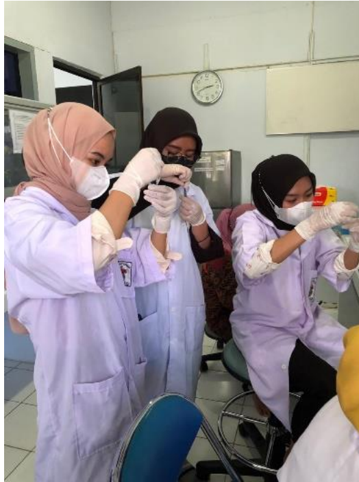
Gambar 3. Proses penggerusan sampel yang telah di timbang