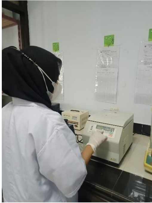
Gambar 5. Proses pengendapan larutan menggunakan mesin sentrifugasi