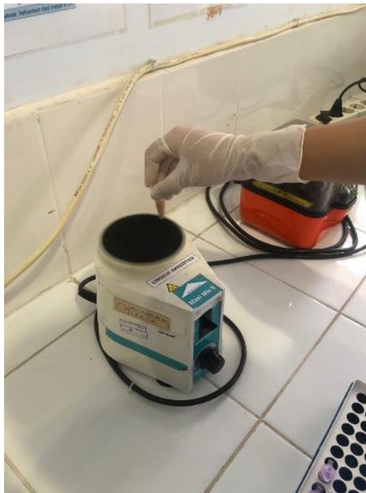
Gambar 4. Proses pelarutan sampel menggunakan mesin vortex