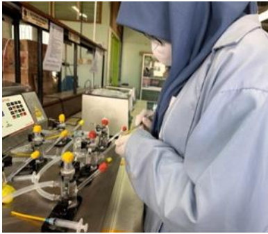
Gambar 11. Uji permeasi secara ex vivo