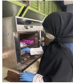
Gambar 12. Ekstraksi RT dari jaringan kulit