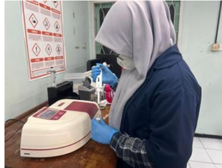
Gambar 10. Pengukuran kadar RT