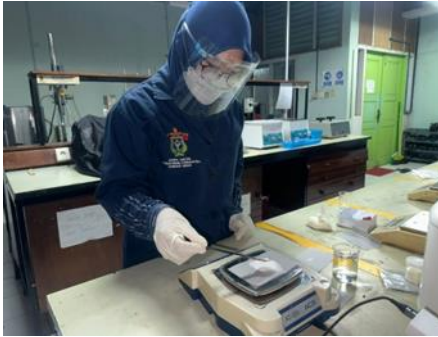
Gambar 9. Formulasi SEMNs-RT