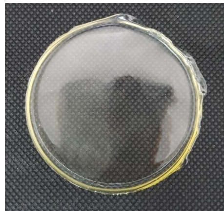
Gambar 20. Hydrogel film