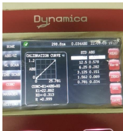
Gambar 19. Pengukuran menggunakan spektrofotometer UV-Vis