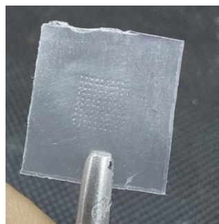
Gambar 21. Uji mekanik dan insersi HFMN