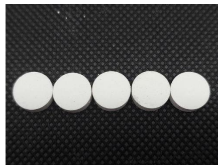
Gambar 22. Reservoir tablet