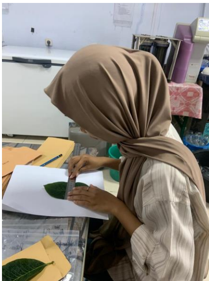
Pengukuran lebar daun