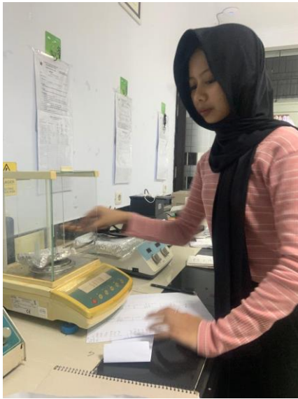
Pengukuran berat sampel