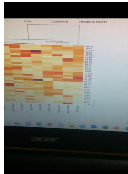
Heatmap dengan Rstudio