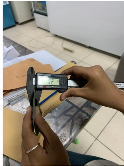
Pengukuran tebal daun