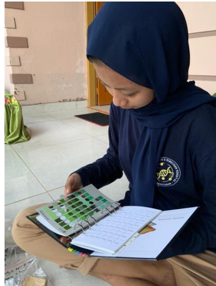
Pengamatan warna sampel