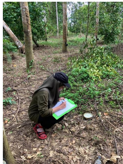
Pohon Pengukuran Suhu