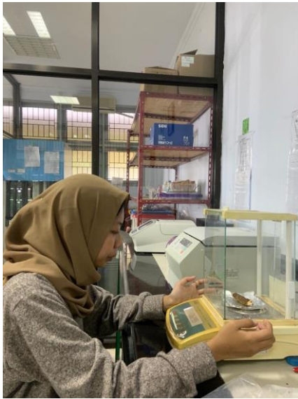
Pengukuran berat akar