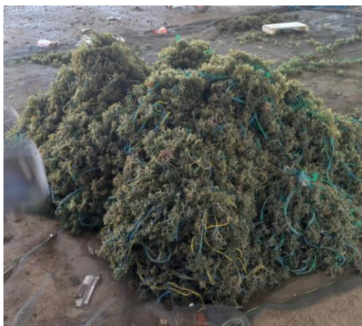
Rumput Laut yang telah diikat