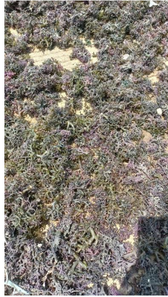
Penjemuran Rumput Laut