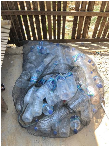
Botol Besar dan Kecil