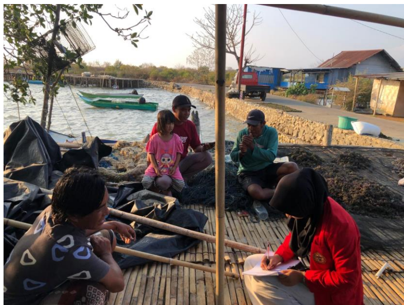
Foto Bersama Responden