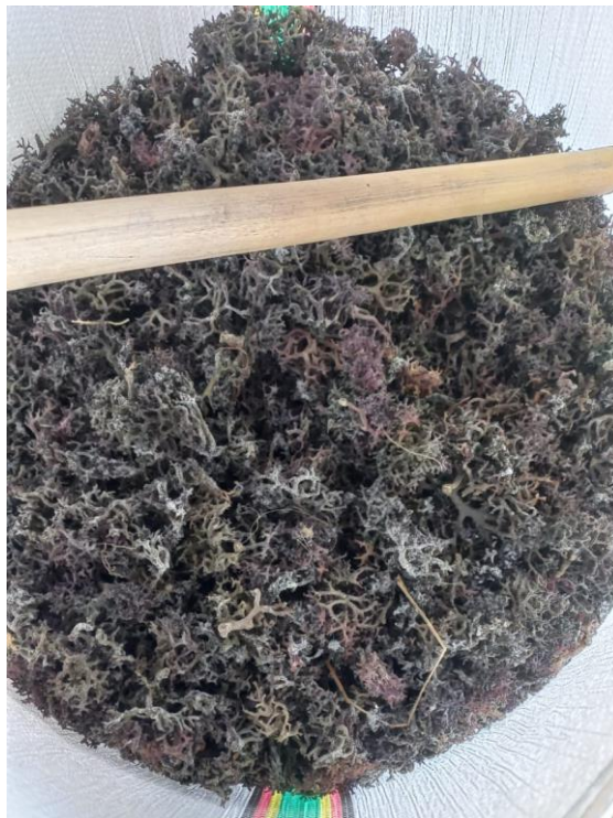
Rumput Laut Kering