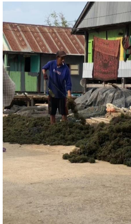
Proses Pemisahan Menggunakan Tangan