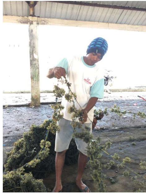
Penyatuan 2 Bentang Tali