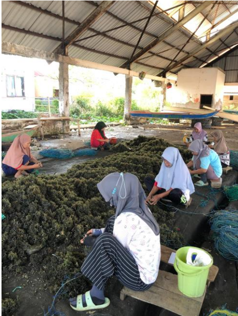
Pengikatan Bibit Rumput Laut