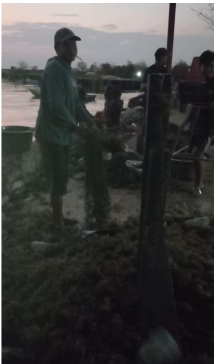
Proses Memisahkan Rumput Laut dari Tali bentangan (Pa'Purusu)