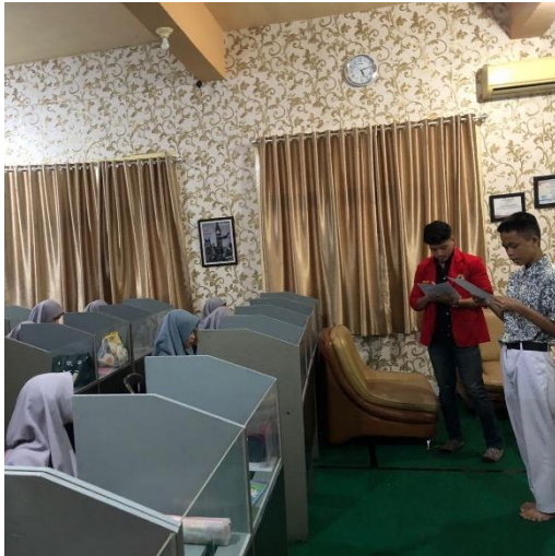
Attached Image 5. Narrative Text Reading