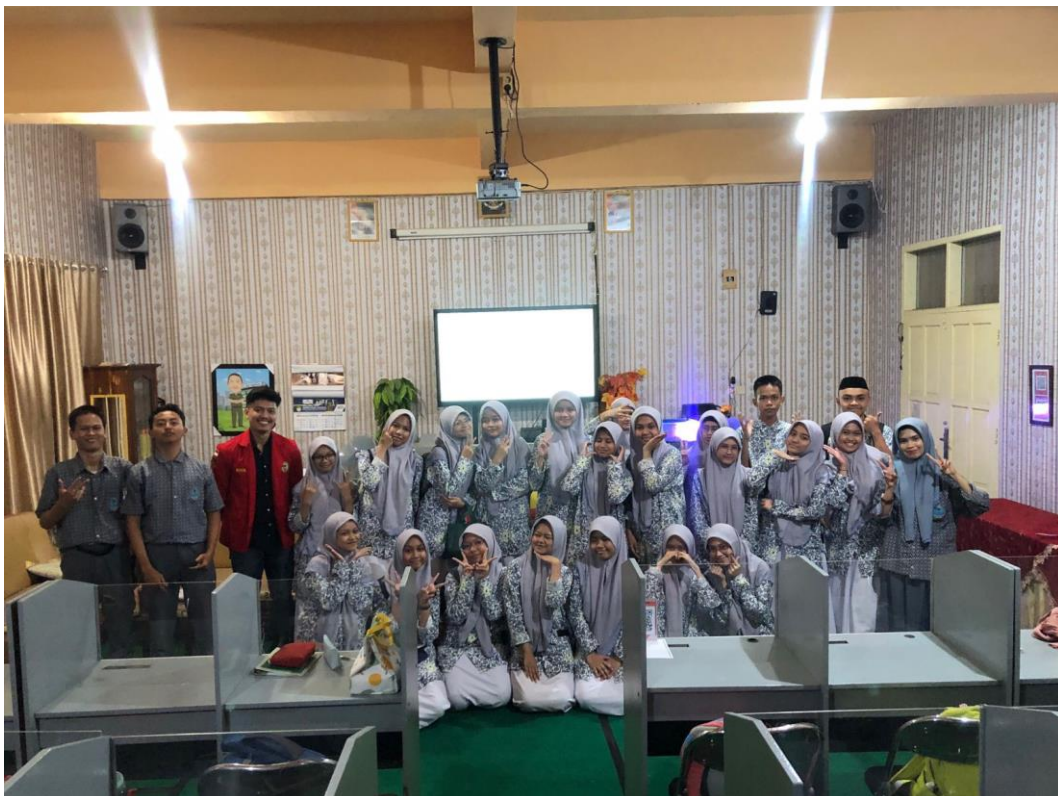
Attached Image 7. Madrasah Aliyah Negeri 2 Makassar English Club Students