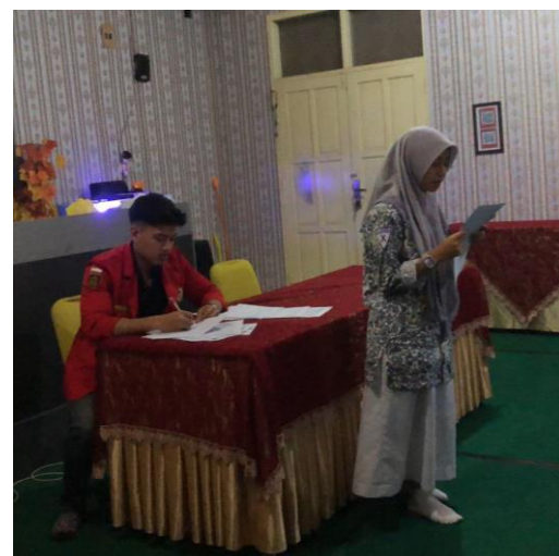
Attached Image 4. Best Experience Reading