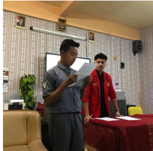
Attached Image 6. Procedure Text Reading