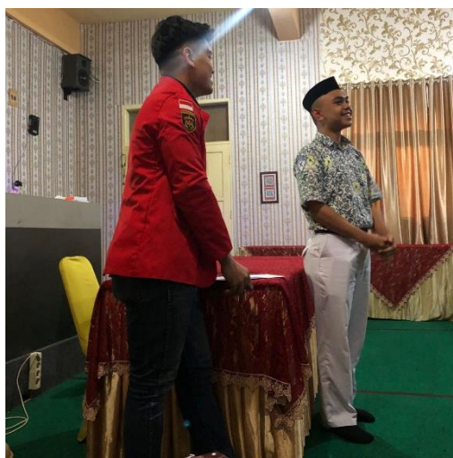
Attached Image 3. Story Telling