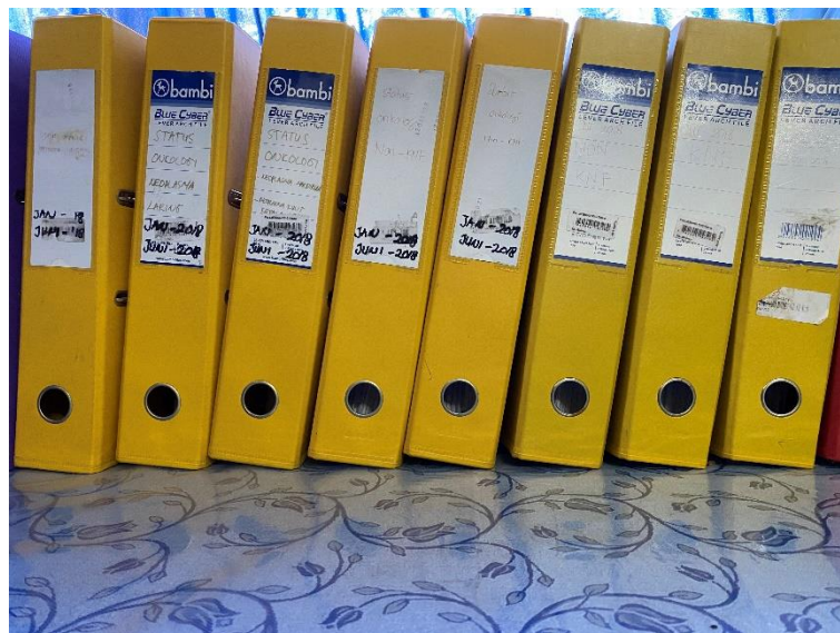
Bundel data pasien (berkas data KNF)