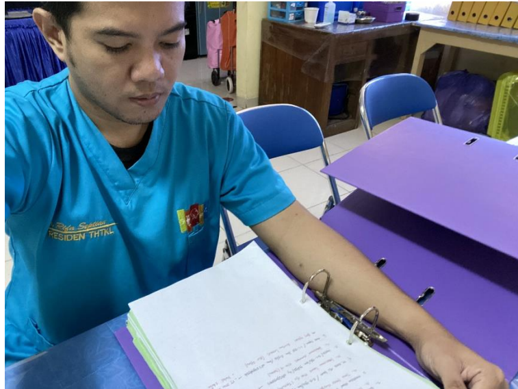
Penelusuran data pasien