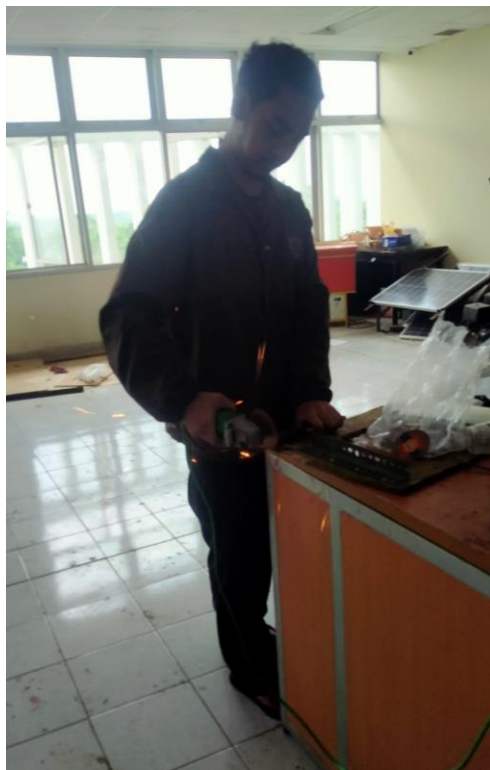
Pembuatan stang untuk dudukan motor pada cwc