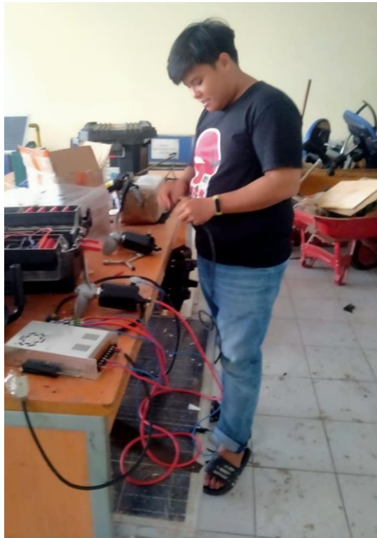
Proses perakitan kabel motor agar aman di gunakan dalam air.