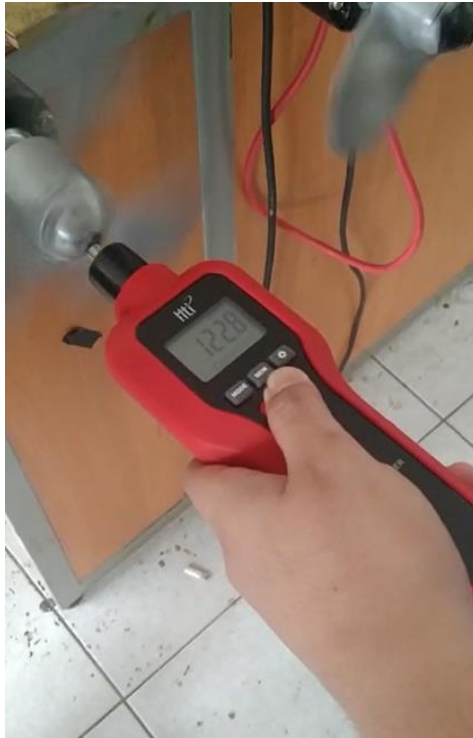
Penguji cobaan putaran motor yang telah di rakit untuk mengetahui putaran kedua motor sama.