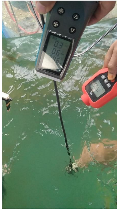
Proses pengkalibrasian sensor rpm dan flowmeter sensor dengan menggunakan Tachometer dan Current Meter Flow watch