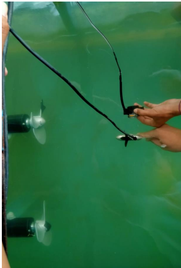
Pengkalibrasian flowmeter sensor dengan menggunakan Current Meter Flow watch.