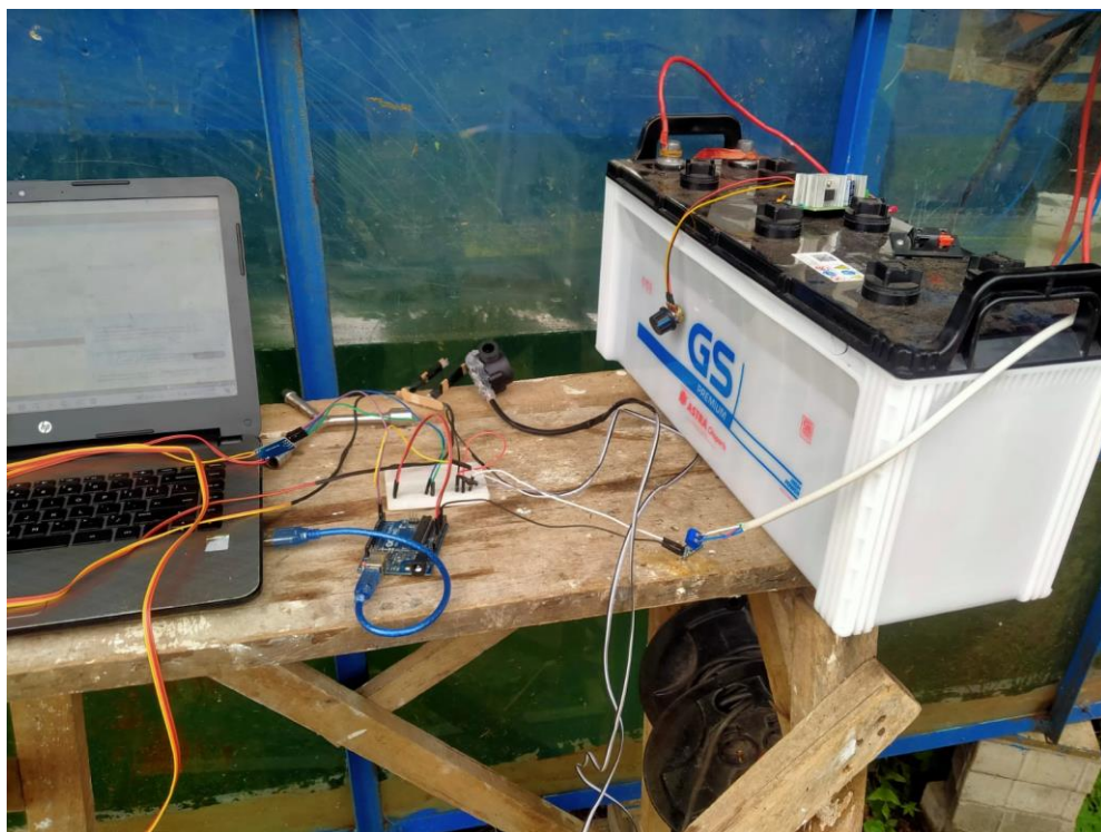
Instalasi kabel sensor voltage, sensor rpm, dan flometer sensor yang disambungkan ke Arduino uno lalu Arduino uno di sambungkan ke Laptop.