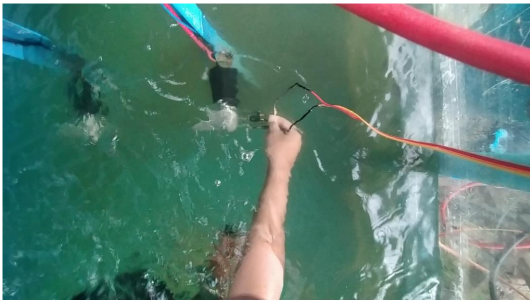
Proses pengambilan data dengan menggunakan sensor rpm dan flowmeter sensor