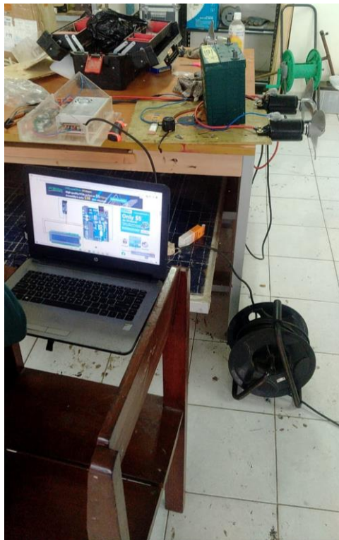
Proses pembuatan coding Arduino untuk membaca sensor yang digunakan.