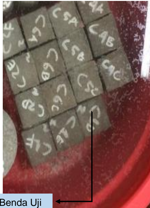
Curing Benda Uji

Dilakukan perawatan dengan metode curing air.