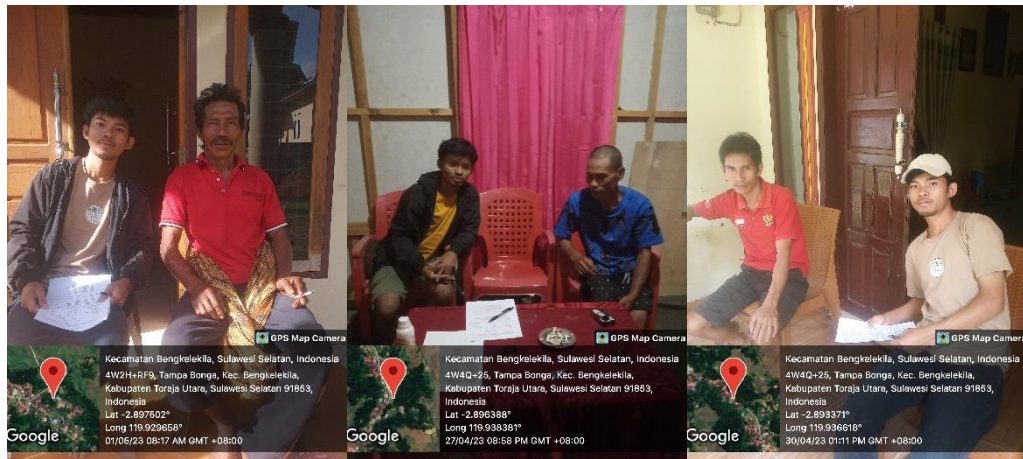
Gambar 2. Wawancara Petani Desa Tampan Bonga