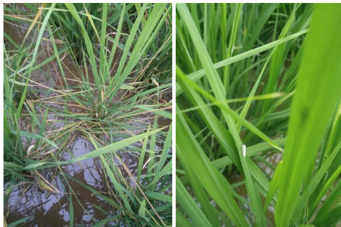
Gambar 4. Hama Utama pada Tanaman Padi