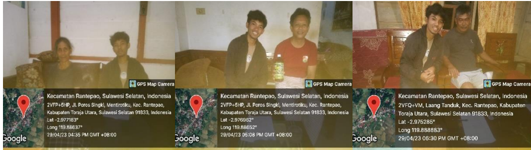
Gambar 1. Wawancara Petani Desa Loang Tanduk