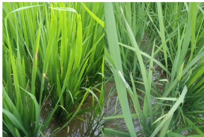
Gambar 5. Musuh Alami pada Tanaman Padi