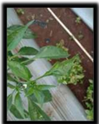
Lampiran Gambar 2. A. Sampel daun cabai, B. Sampel serangga, C. Contoh pengamatan menggunakan plastik berlubang dengan diameter 1x1 cm 2 . D. Proses pengamatan menggunakan mikroskop serangga.