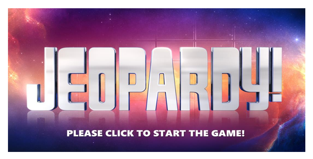
Figure 1. Jeopardy!