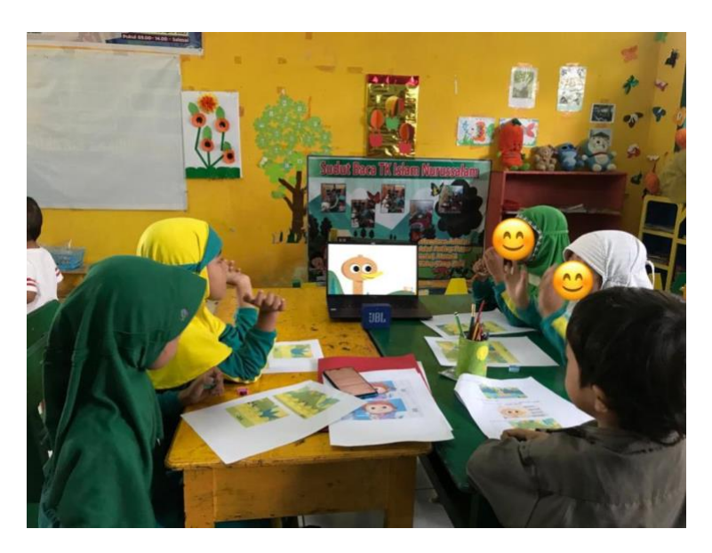
Photo 2 : The children sing aloud together and watch the official video of "Five Little Ducks" on YouTube.