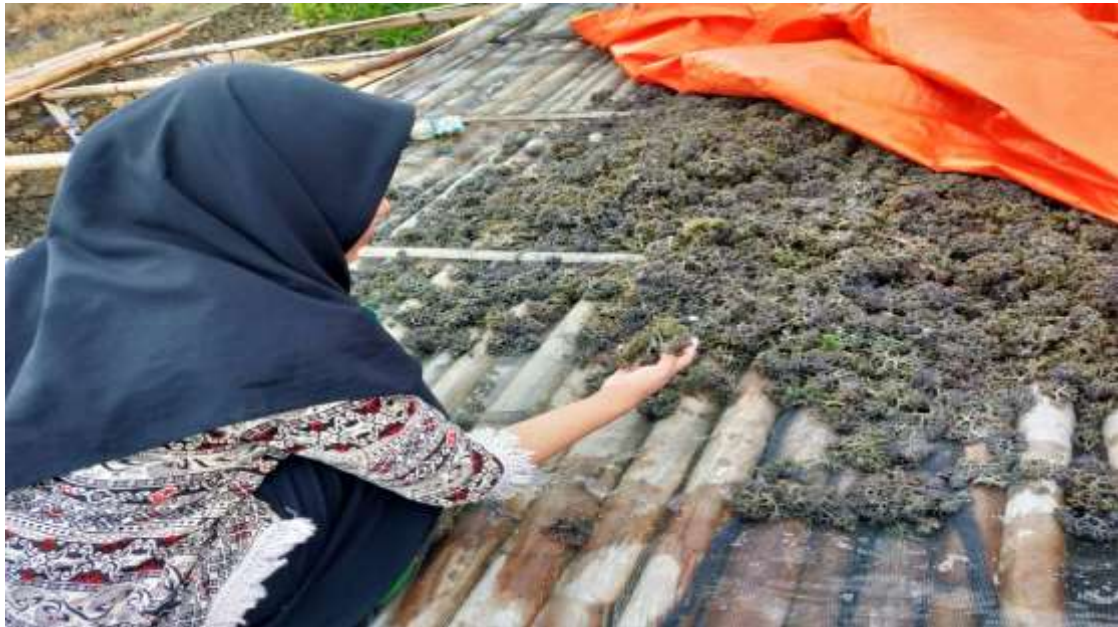
Proses Pengeringan Rumput Laut