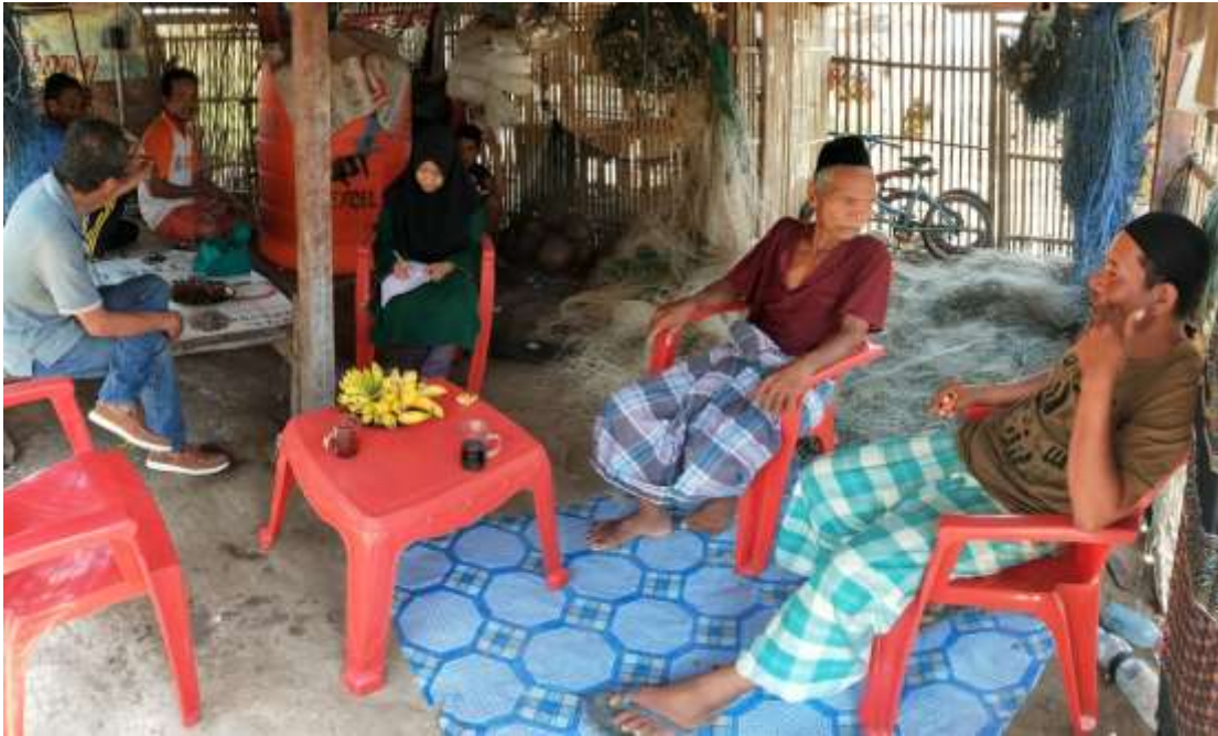
Wawancara Responden Petani Rumput Laut di Kecamatan Ma'rang