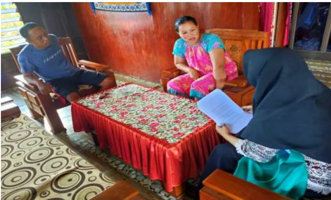
Wawancara Responden Petani Rumput Laut di Kecamatan Ma'rang