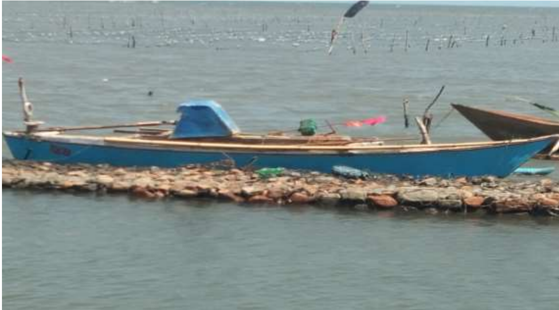
Proses Budidaya Rumput Laut di Kecamatan Ma'rang