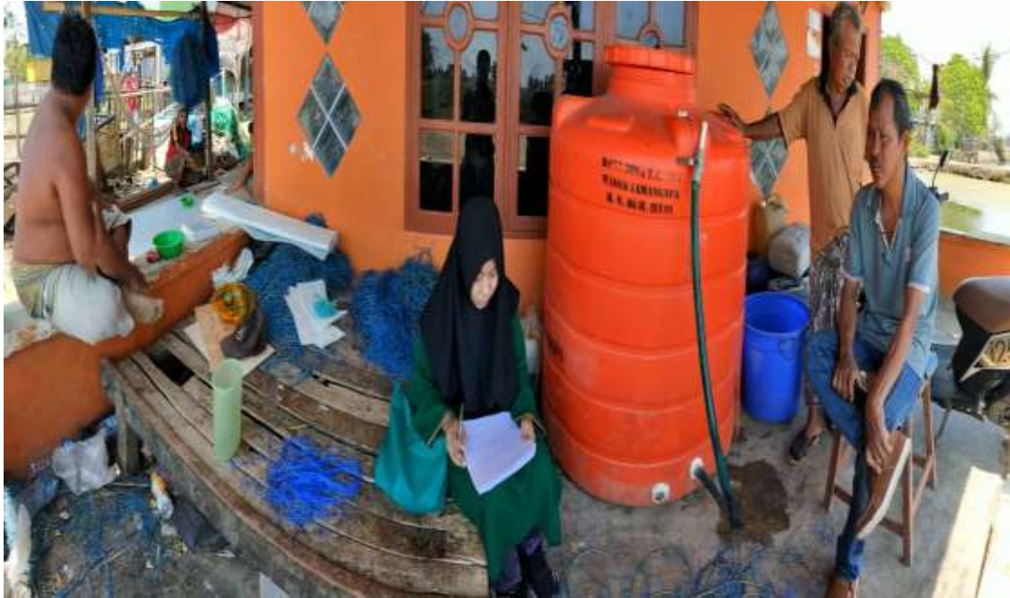
Wawancara pedagang pengumpul Rumput Laut di Kecamatan Ma'rang