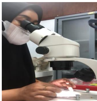
Gambar 25. Pengamatan menggunakan mikroskop