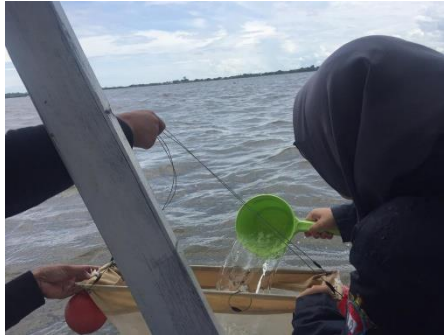
Gambar 22. Pengambilan sampel air