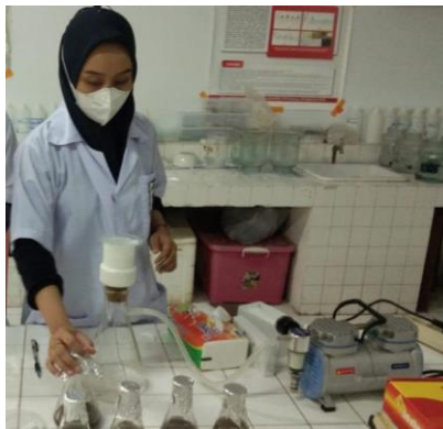
Gambar 24. Sampel disaring menggunakan kertas saring whatmann dibawah vacum pump