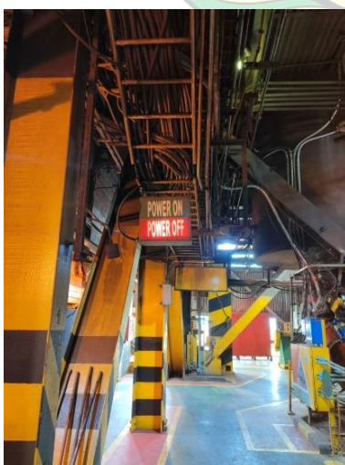
Furnace OFF (Shutdown)