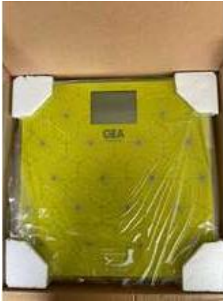
Timbangan berat badan