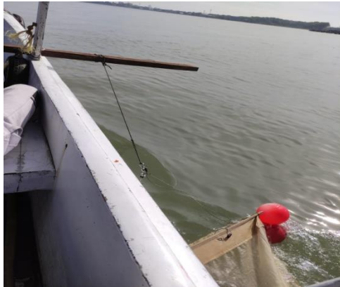
Pengambilan Sampel Air