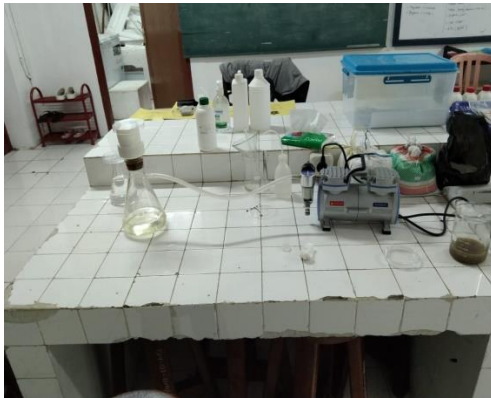
Penyaringan Sampel Air