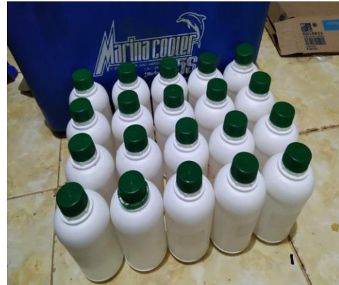
Sampel + KOH 10%