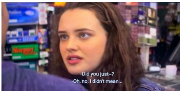
Tape 3 side a (00:34:34) - (00:34:55)

-Did you just-? -Oh, no, I didn't mean...