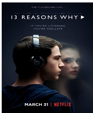
13 REASONS WHY