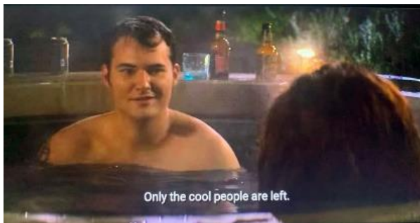
Tape 2 side a (00:42:46) - (00:43:02)

-Did you just-? -Oh, no, I didn't mean...