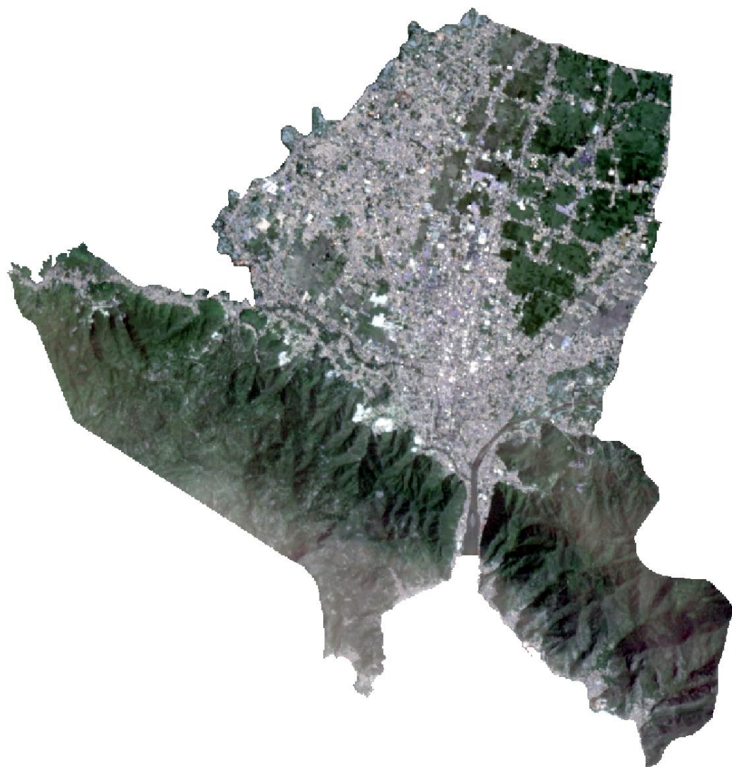
Lampiran 1. Citra landsat 8 OLI/TIRS komposit warna natural penajaman resolusi 15 m (Band Pankromatik) Kota Gorontalo Tahun 2016