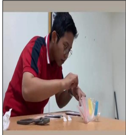
Proses persiapan model uji untuk pengambilan data secara eksperimental