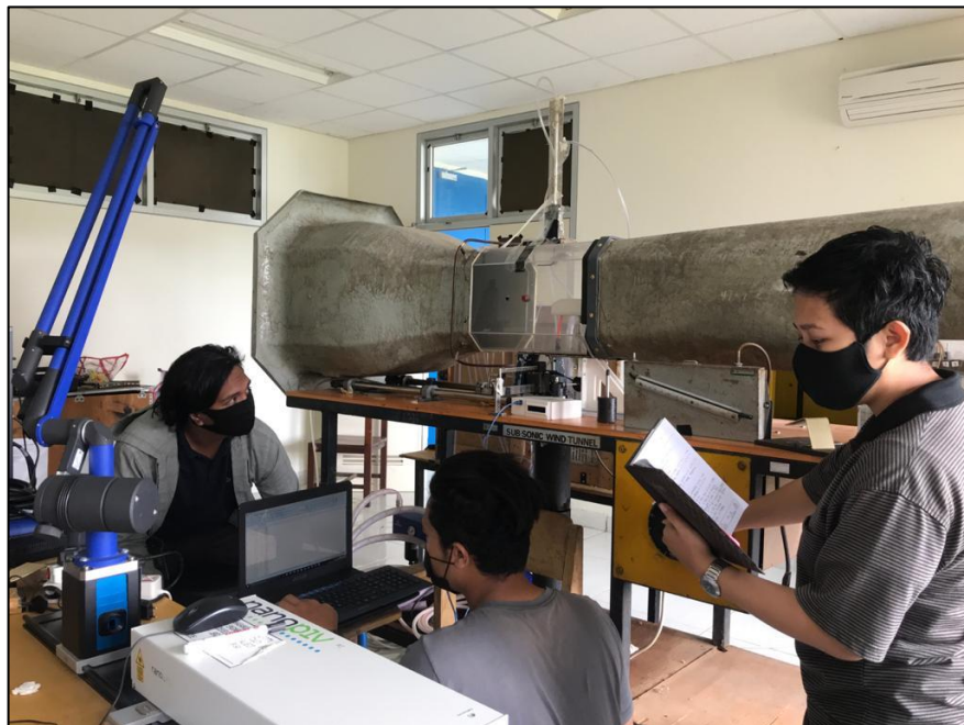
Proses pengambilan data secara eksperimental